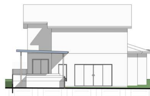
5 SOUTH WEST ELEVATION 1 : 250