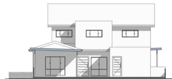
2 NORTH EAST ELEVATION 1 : 250