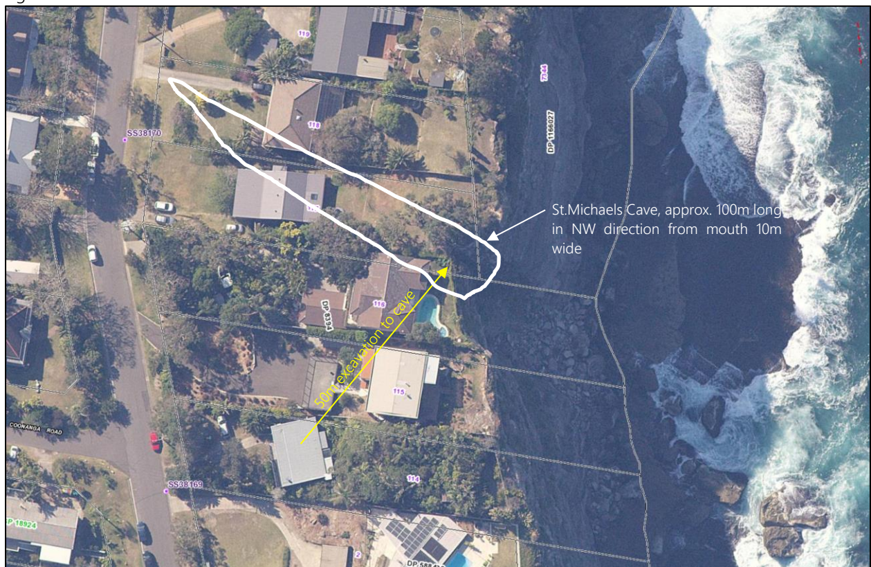
Figure 1. Aerial of St.Michael's Cave

The cave entrance is located approximately 50 metres north of the subject property No.73 Marine Parade, as indicated in Figure 1.