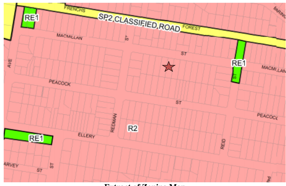
Extract of Zoning Map