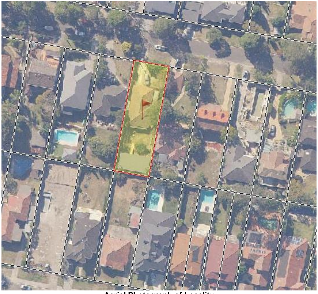
Aerial Photograph of Locality

The existing surrounding development comprises a mixture of original single level dwellings interspersed with large two storey dwellings of modern architecture. The existing surrounding development is depicted in the following aerial photograph: