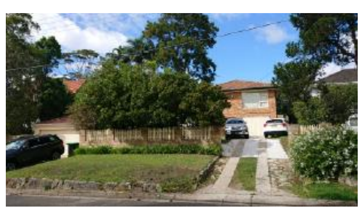
View of Subject Site from Macmillan Street

The site is depicted in the following photographs: