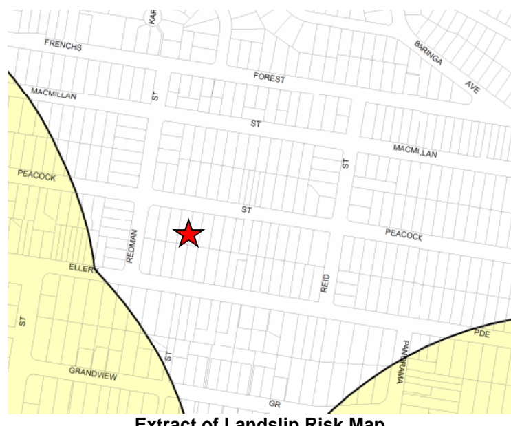
Clause 6.1 Acid Sulphate Soils Map, Landskip Risk Map.