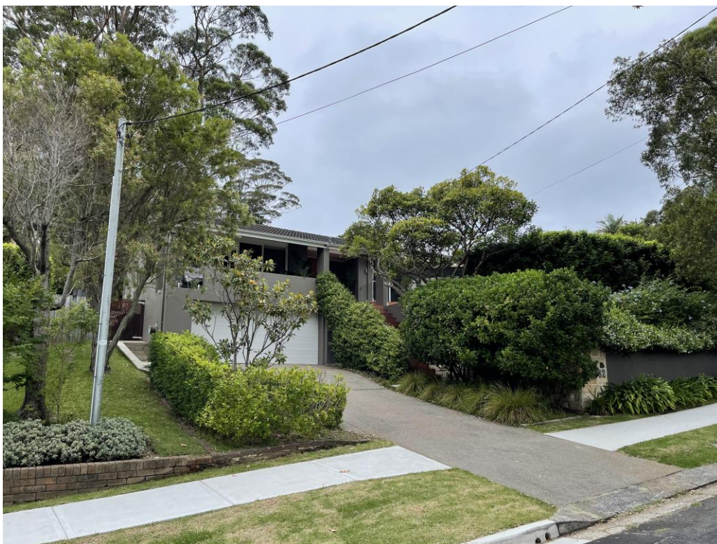
Fig 5: View looking south-east towards the neighbouring dwelling with covered front deck at No 32 Terama Street