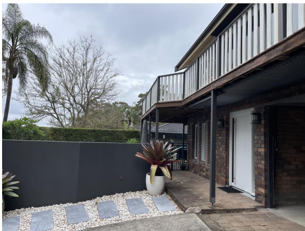
Fig 3: View looking north of the existing front, first floor deck which will be demolished and replaced with a new, partly covered deck