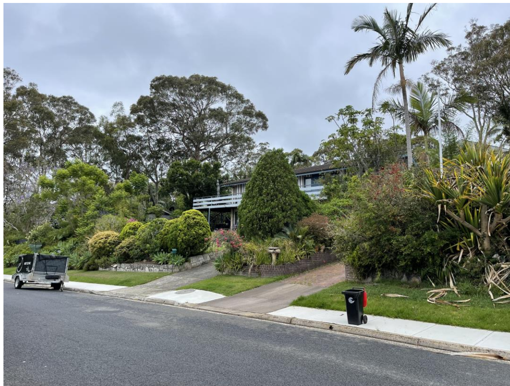
Fig 6: View of the streetscape to the north of the site, looking north-east from Terama Street