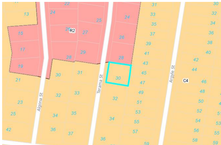
Fig 8: Extract of Pittwater Local Environmental Plan 2014 Zoning Map

The subject site is zoned C4 Environmental Living under the Pittwater LEP 2014.