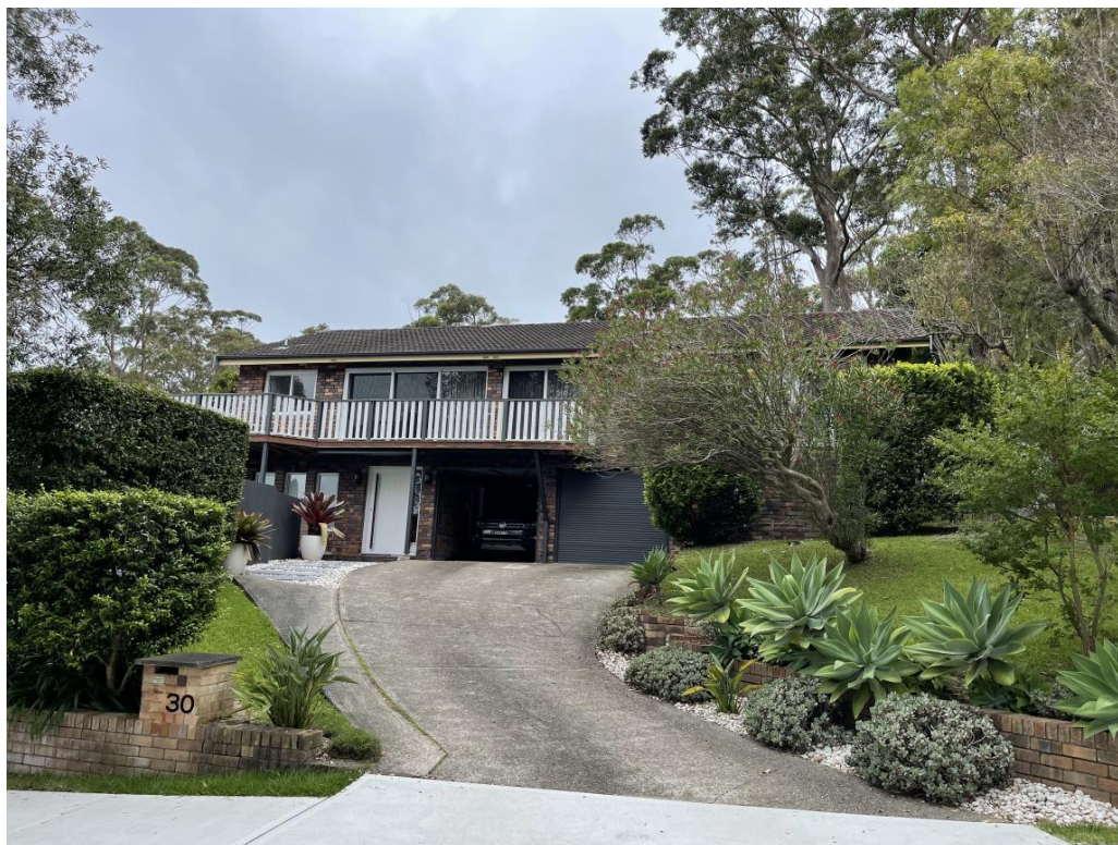
Fig 2: View of the subject site, looking north-east from Terama Street