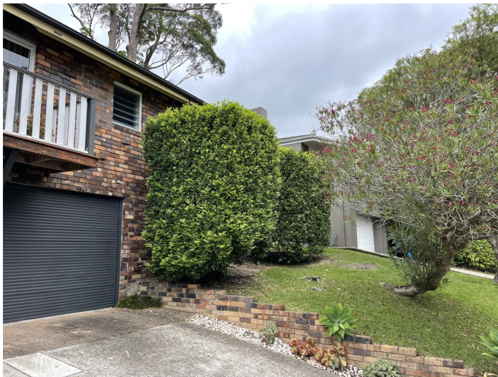
Fig 4: View of the existing front façade of the dwelling, looking south-east