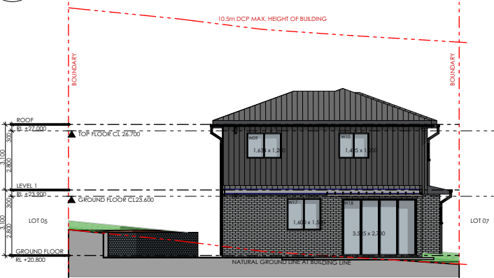
3 EAST ELEVATION 1:250