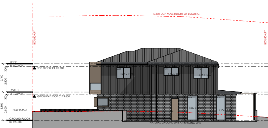
4 SOUTH ELEVATION 1:250