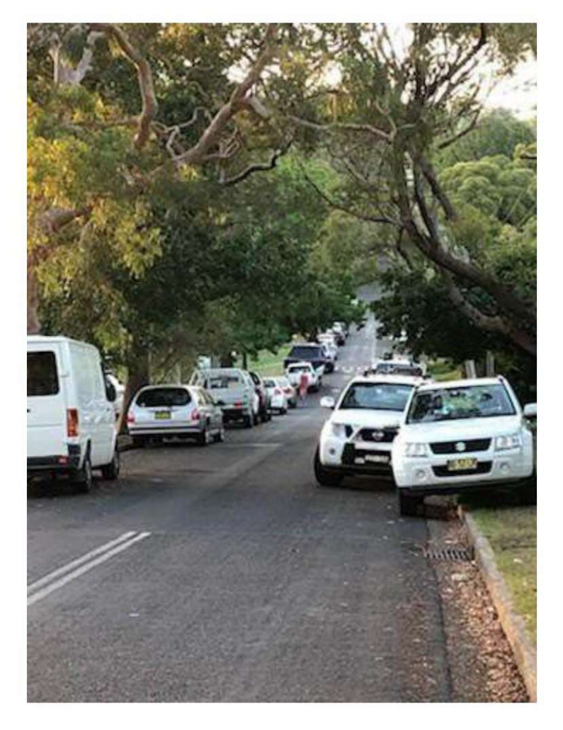
Figure 2- on street parking

Furthermore, myself and other residents of the street have legitimate concerns over the ability of Cooleena Road to support more on-street parking. On-street parking has become limited on the street andmade worse during peak periods in the afternoons and evenings with people returning home. Images of the on-street parking situation are provided below.