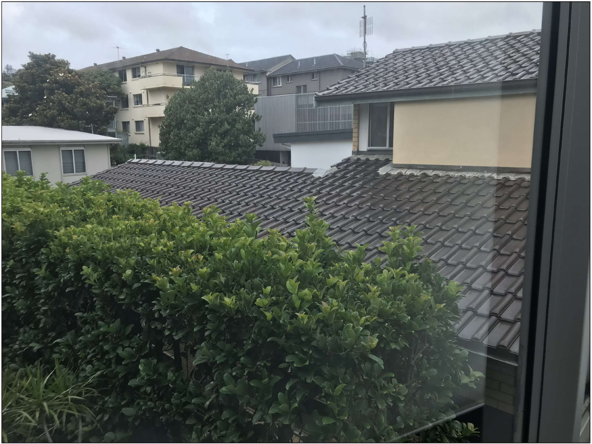
Figure 2: View across the existing roof of No. 44 Kooloora Avenue facing north east towards proposed Windows 118 and 119 from an upper level rear facing bedroom window at No. 42.