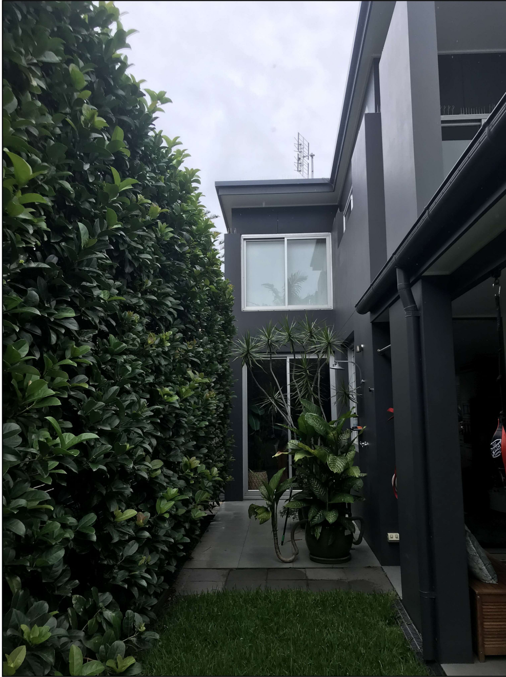
Figure 1: View of upper level rear facing bedroom windows at No. 42 Kooloora Avenue.