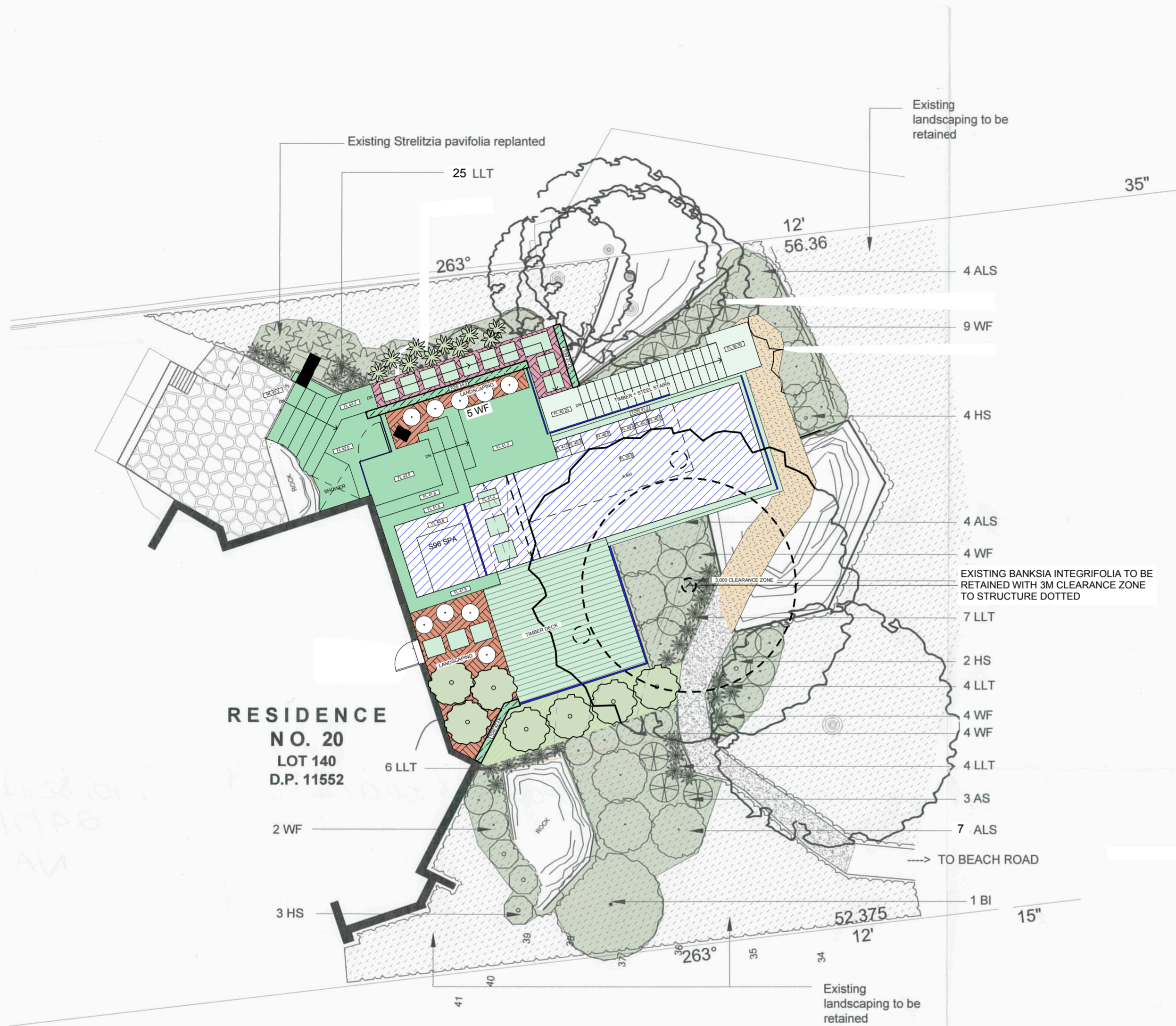
PLAN SCALE 1:100