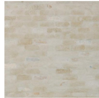
3. BAGGED RECYCLED BRICK EXTERNAL WALL. EARTHY NATURAL SAND CEMENT FINISH. (CR)