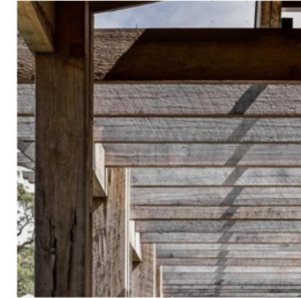
8. EXPRESSED RECYCLED HARDWOOD STRUCTURAL POST, BEAMS, JOISTS AND RAFTERS (T)