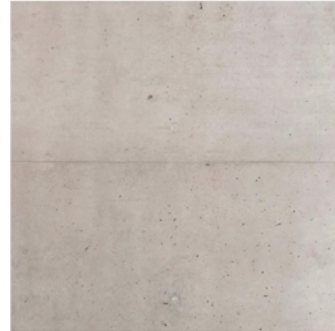
6. EXPRESSED OFF FORM & STEEL TROWEL FINISHED REINFORCED CONCRETE SLABS. (RC)