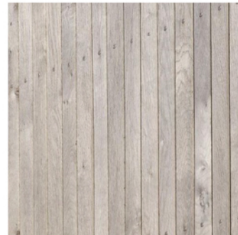
2. AUSTRALIAN HARDWOOD EXTERNAL WALL CLADDING AND EXTERNAL DECKING. WEATHERED FINISH (T)