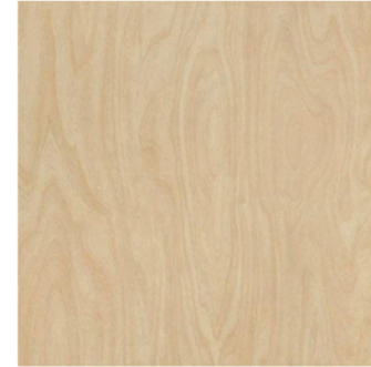
7. PLY INTERNAL WALL AND CEILING LININGS. NATURAL FINISH (T)