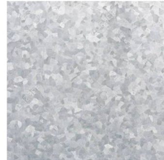
5. EXPRESSED GALVANISED STRUCTURAL STEEL POST AND BEAMS, GUTTERS, DOWNPIPES AND RAINWATER TANKS (MT) (G) (DP) (RWT)