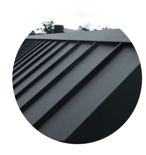
RF - Proposed Roofing Monument - Colorbond To suit 3 degree pitch Gutters, Cappings & Flashings. Refer Hydraulic Plans for sizes & spec