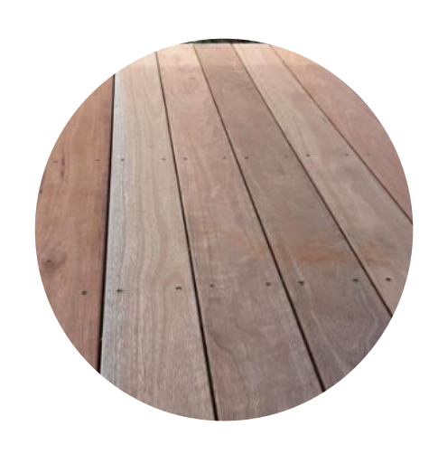
TM - Timber Decking External Balcony Spotted Gum or similar hardwood Sealed, Stainless steel fixings