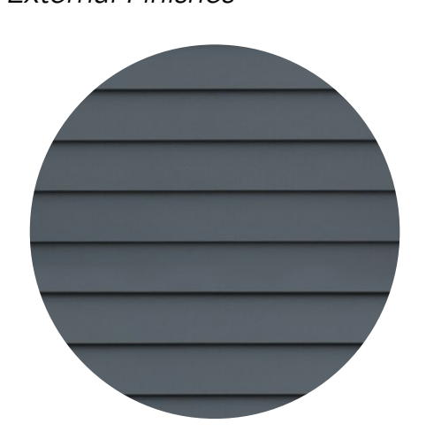
WB - External Cladding Ground Floor + Garage James Hardie Linea board Colour: Monument (Paint Finish)