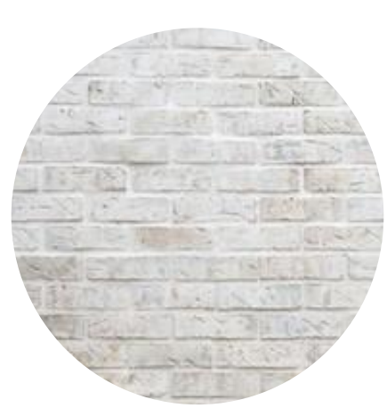
BR - External Cladding Reclaimed Bricks Light bagged render to surface. White wash Paint finish -