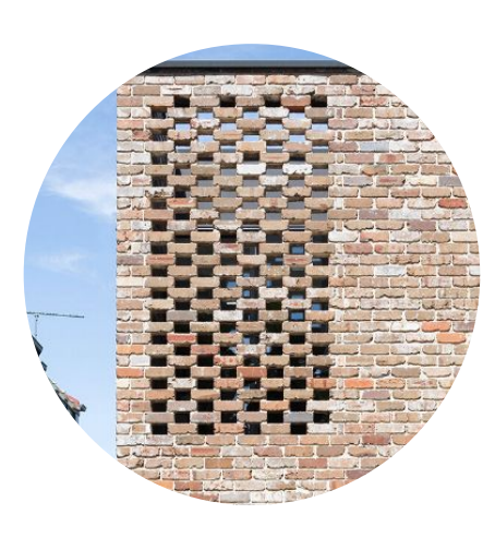
SBR - Spaced Bricks with glazing behind for privacy Ground Floor Entry Breezeway Reclaimed Bricks