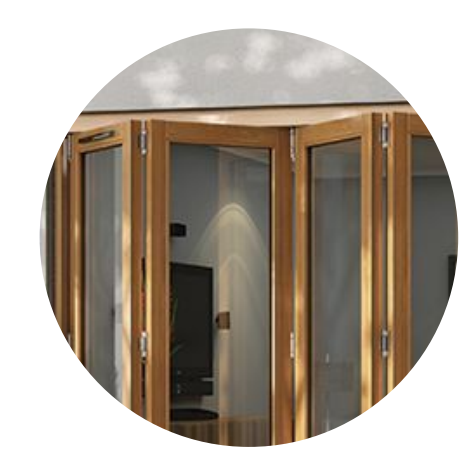
TIM - Timber Windows Refer Window/Door Schedule