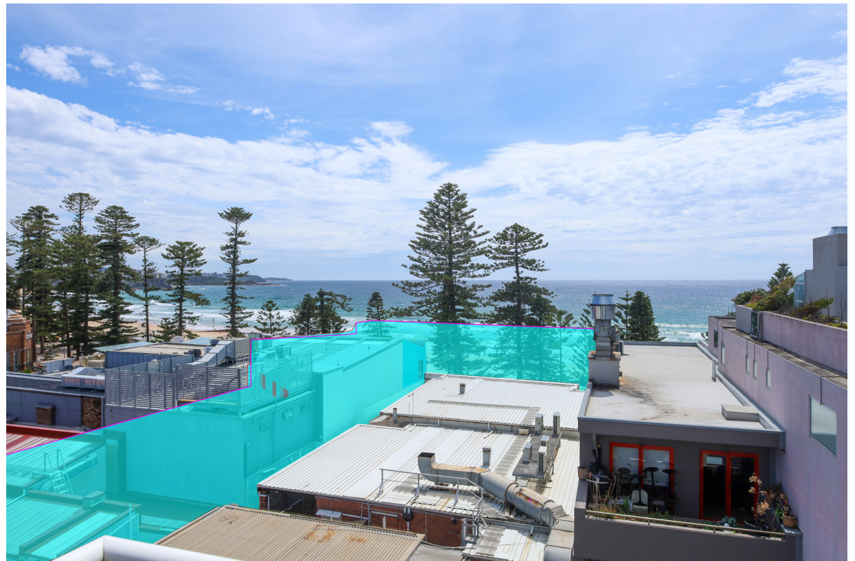
Visual Impact indicated in cyan overlay with red outline and approved D.A outlined in magenta