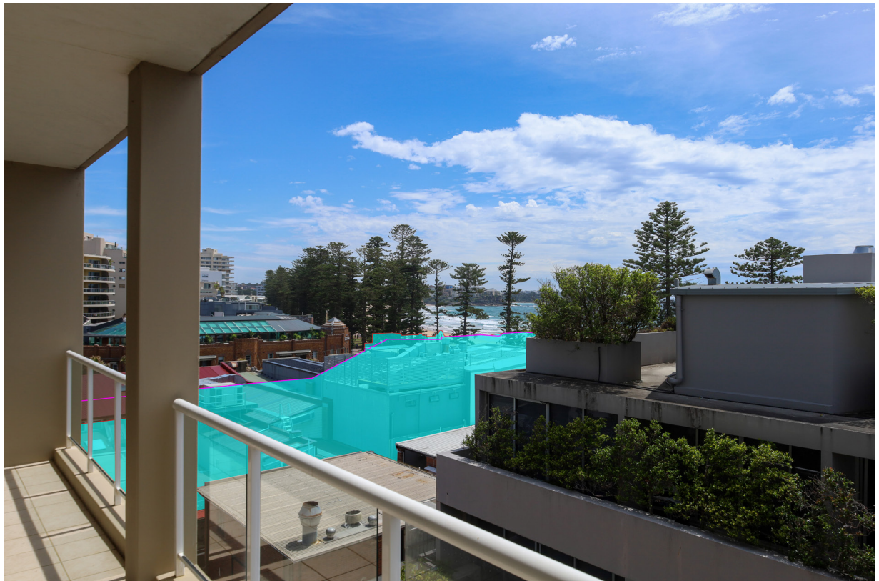
Visual Impact indicated in cyan overlay with red outline and approved D.A outlined in magenta