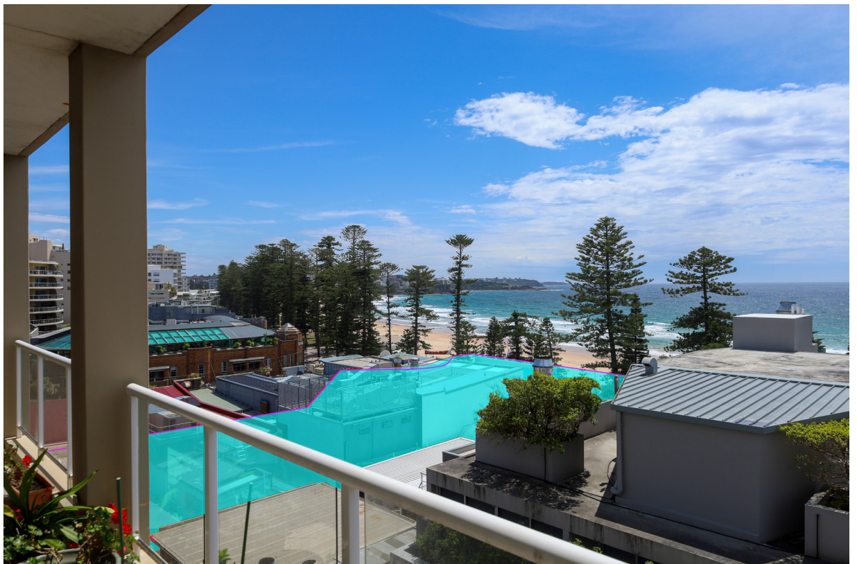
Visual Impact indicated in cyan overlay with red outline and approved D.A outlined in magenta