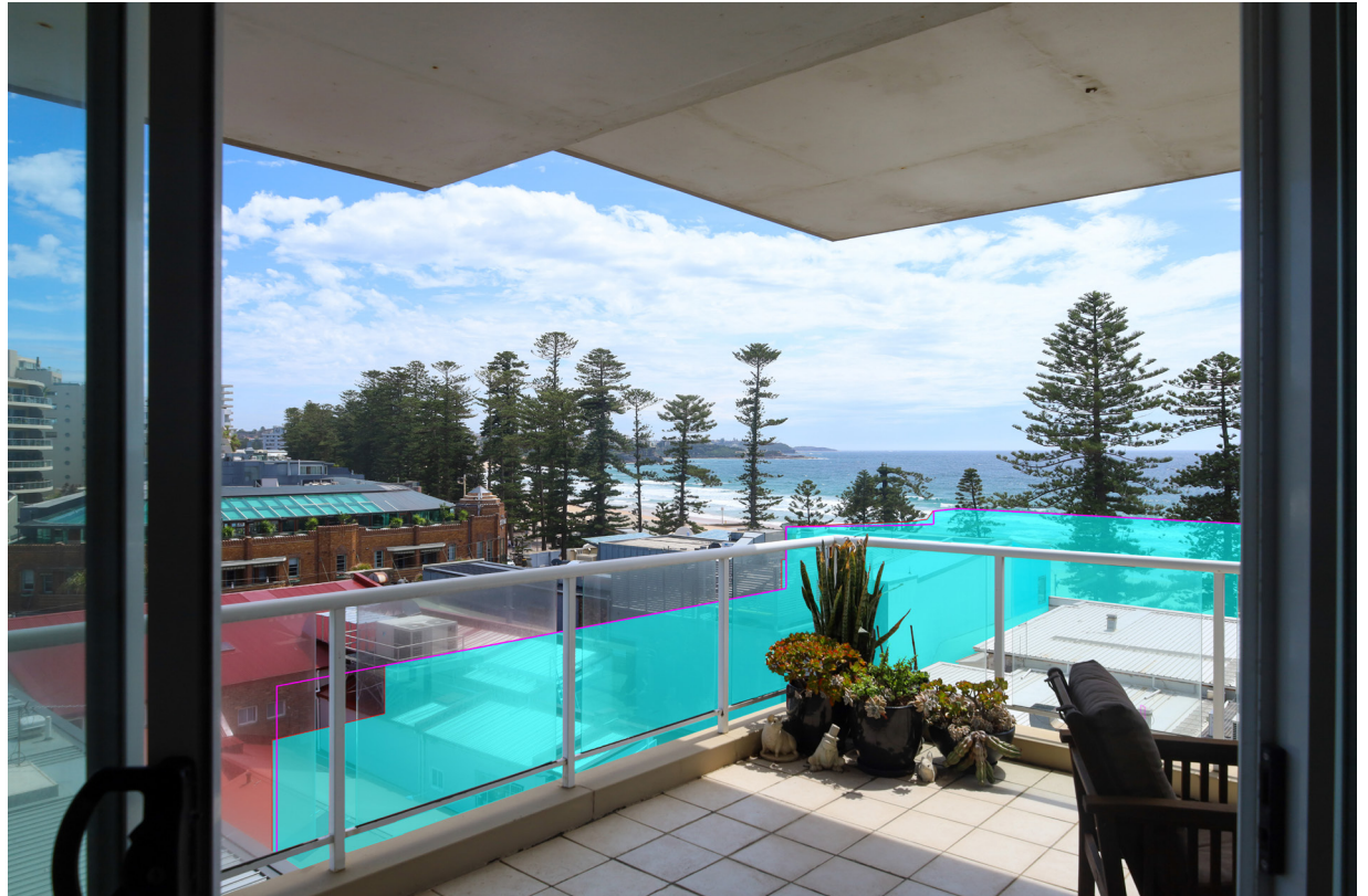
Visual Impact indicated in cyan overlay with red outline and approved D.A outlined in magenta