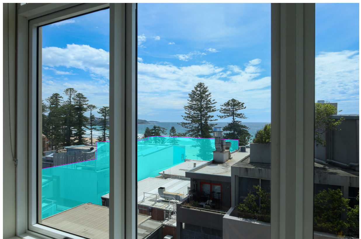
Visual Impact indicated in cyan overlay with red outline and approved D.A outlined in magenta