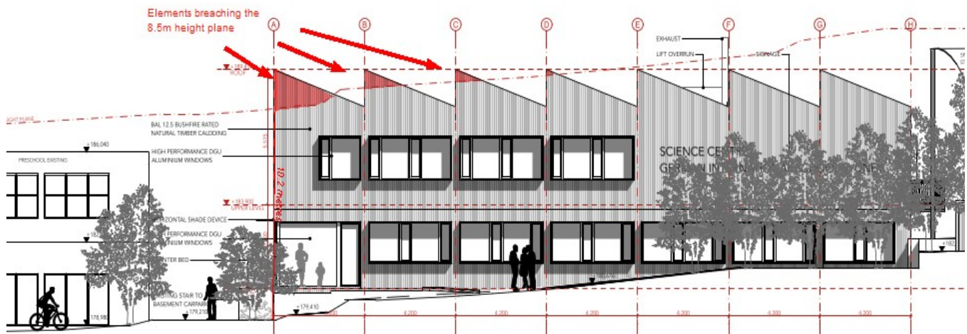
South Elevation showing the 8.5m Height Breach (source Betti & Knutt Architecture)

The building is set back 20.0m from Myoora Road and the saw tooth roof profile, which contributes to the height breach, helps articulate the building to reduce the perceived bulk and scale. In addition, the proposed mass planting along the street frontage will also assist in softening the built form. The minor height breach will not give rise to an unreasonable visual impacts on the streetscape and the proposed timber cladding is consistent with the bushland character of the area. Given the extensive set back of the building from the site boundaries the proposal will not result in unreasonable impacts on neighbouring amenity by virtue of overshadowing or visual and acoustic privacy.