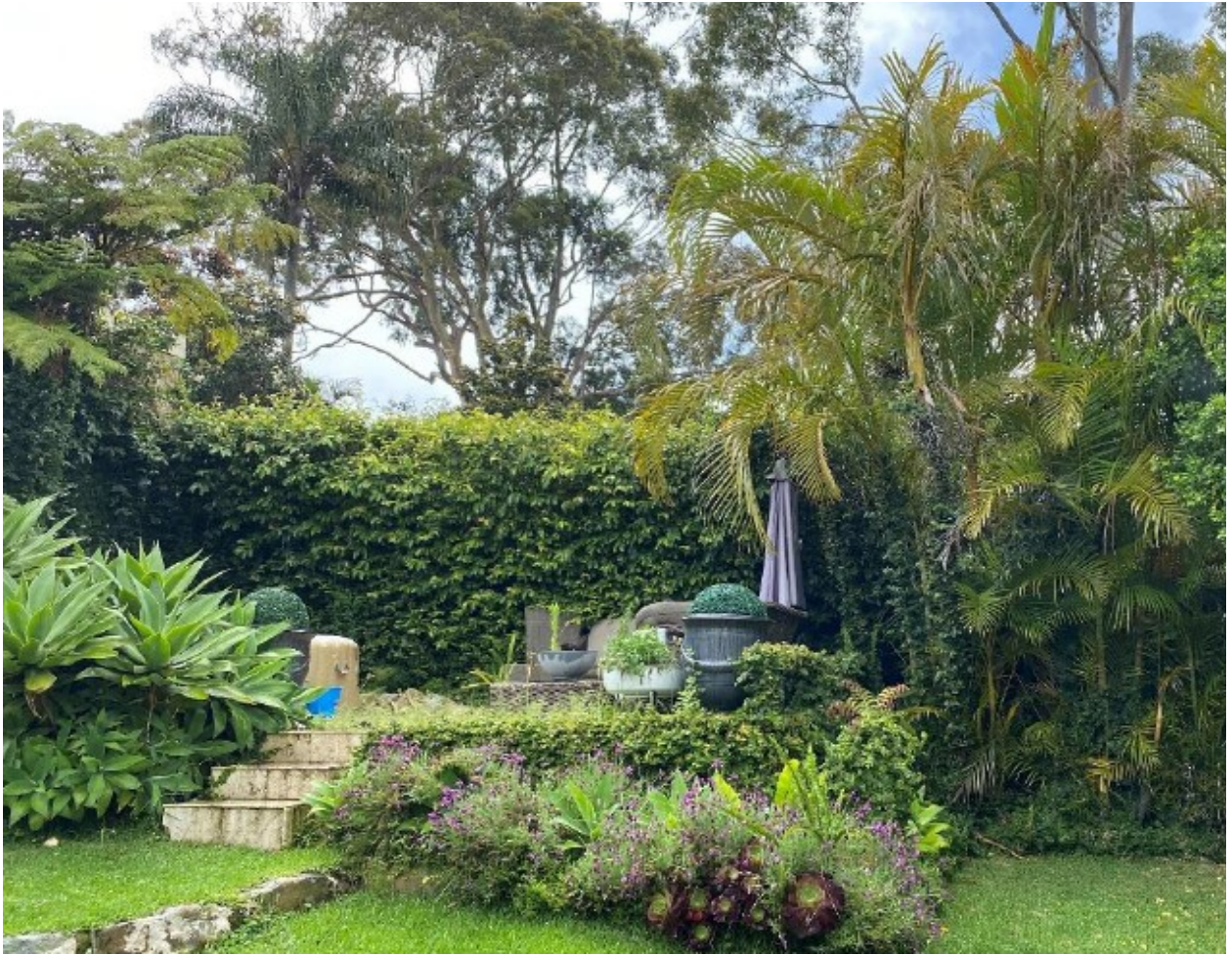
Figure 2: Looking east towards the rear boundary