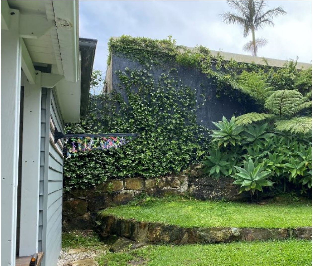
Figure 3: Looking north towards the side boundary