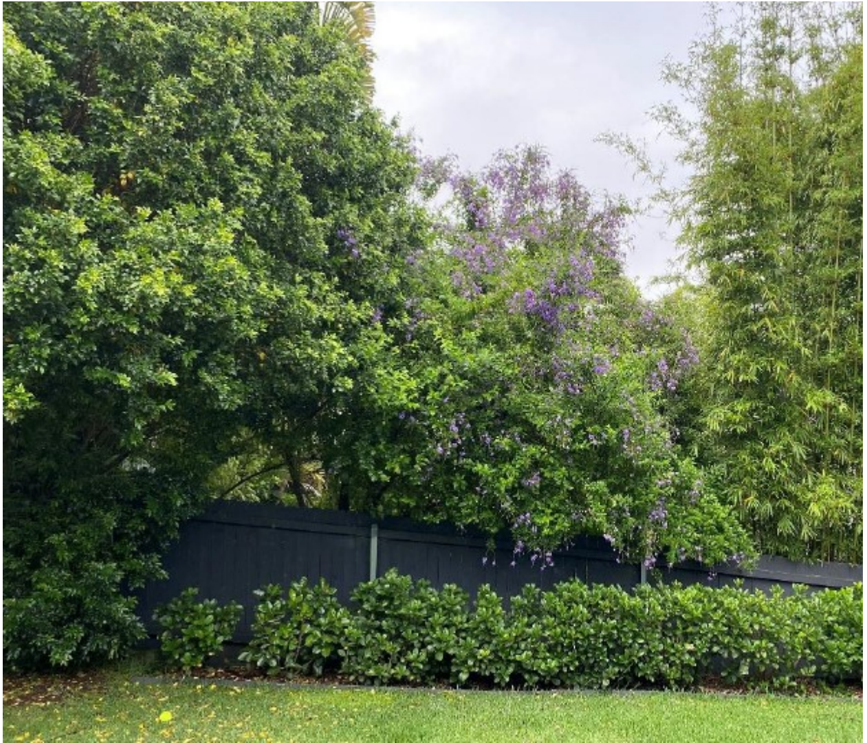
Figure 1: Looking south towards the side boundary