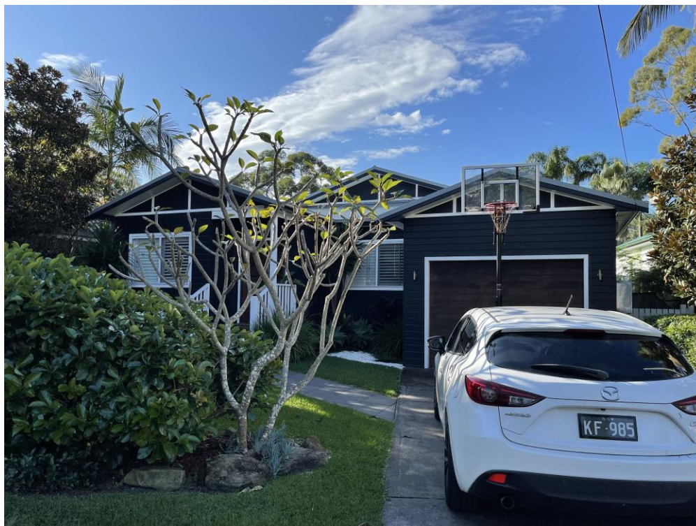
Fig 2: View of subject site, looking north-west from Gondola Road