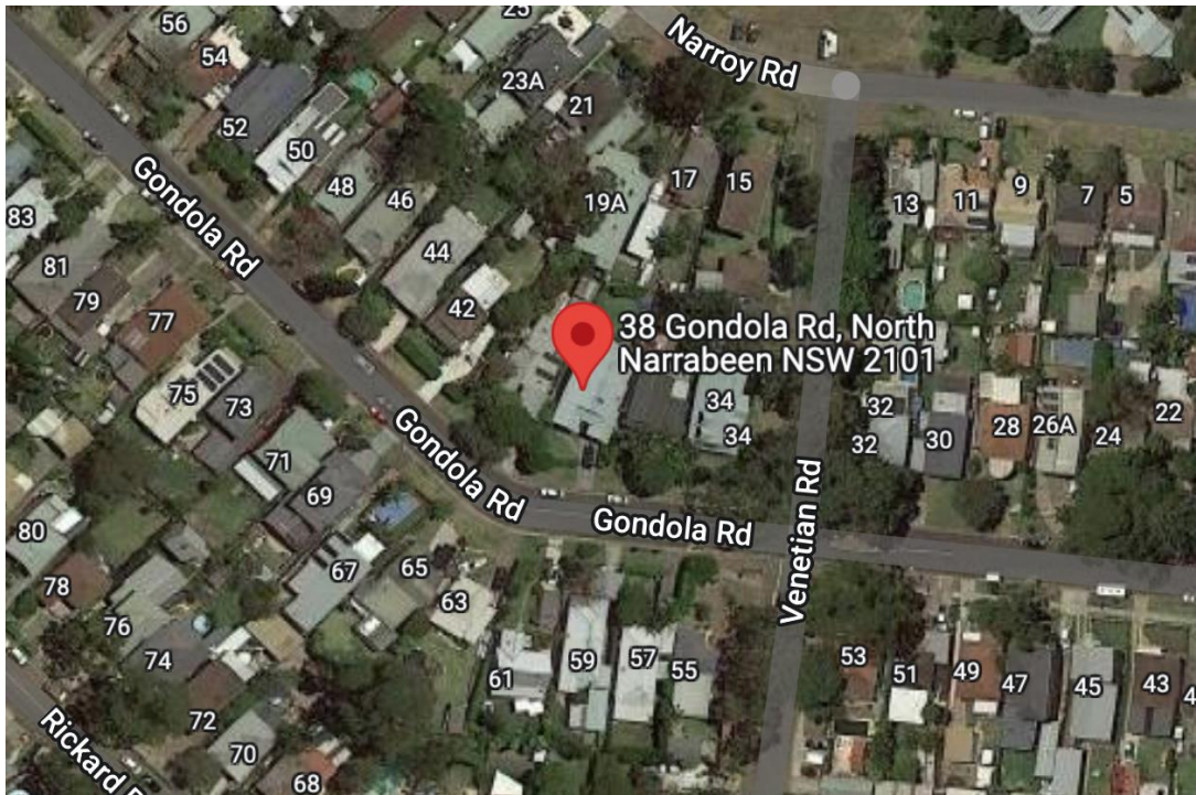
Fig 7: Aerial view of subject site and surrounds

Swimming pools are common features within the rear yards of properties in this area.