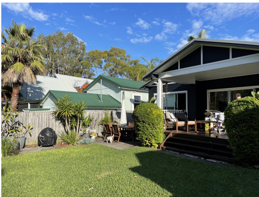
Fig 3: View of the rear elevation of the dwelling, looking south-east