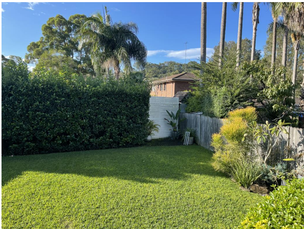
Fig 4: View of the proposed pool location in the rear, north-eastern corner of the site, looking north-east