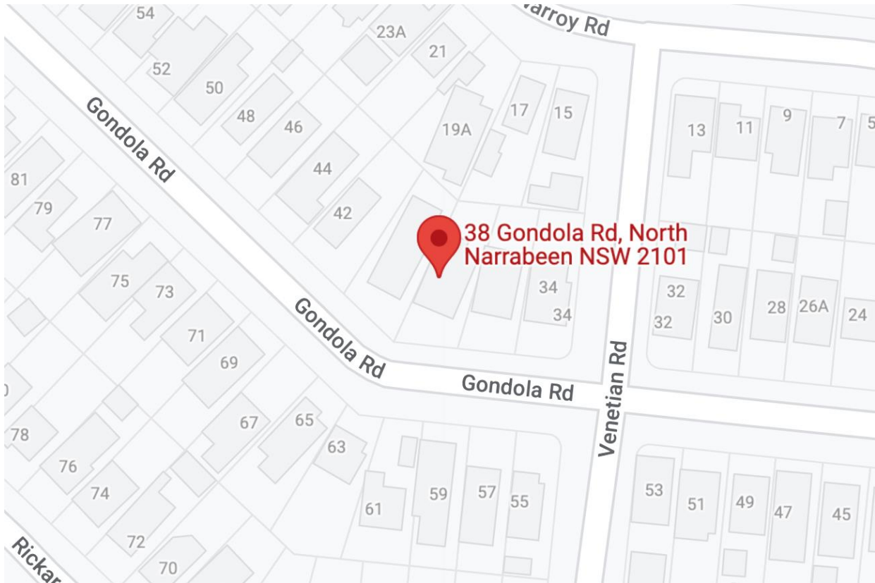
Fig 1: Location of subject site

The details of the site are included on the Survey Plan prepared by ENG Land Services, Reference No. 211216D1GN, dated 16 December 2021, which accompanies the DA submission.