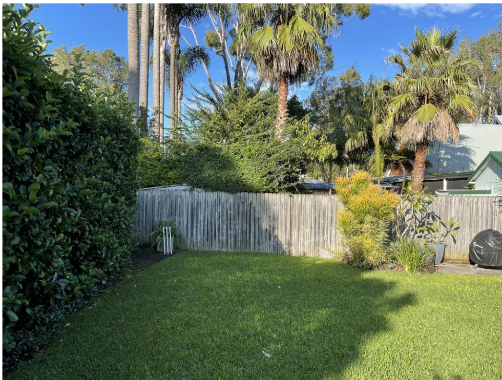
Fig 6: View looking east along the rear boundary