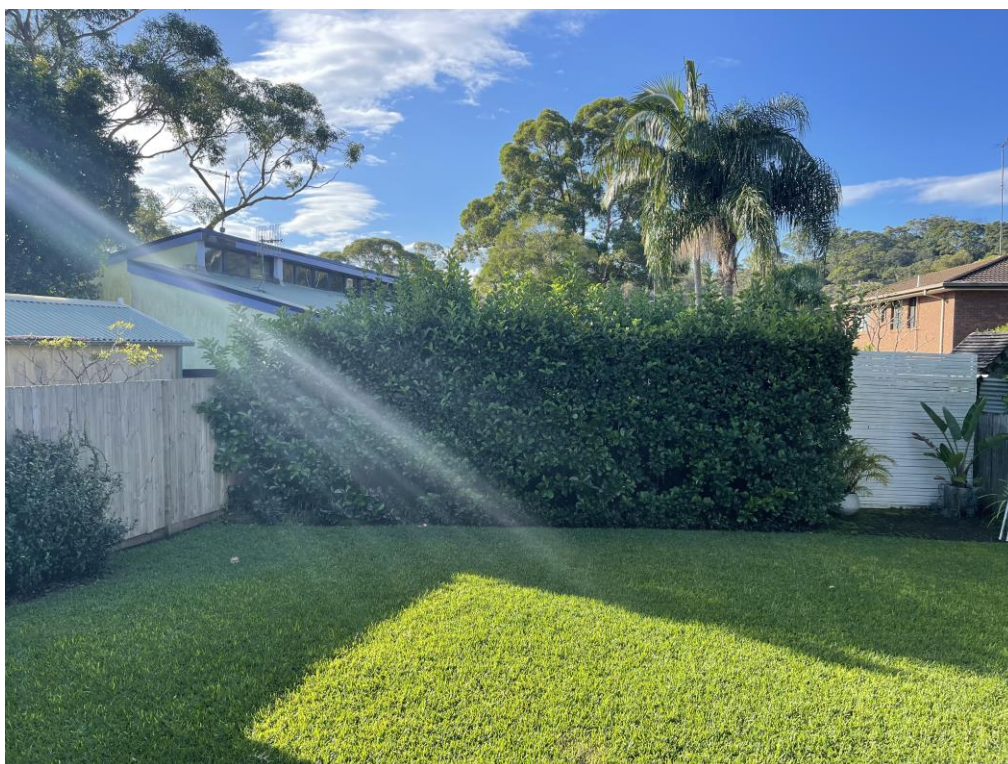
Fig 5: View looking towards the location of the proposed pool adjacent to the rear boundary, looking north-east