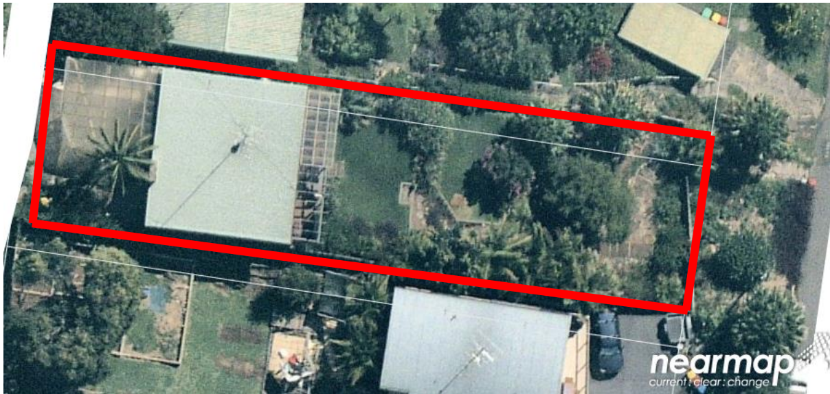
Figure 1: The subject site outlined in red.