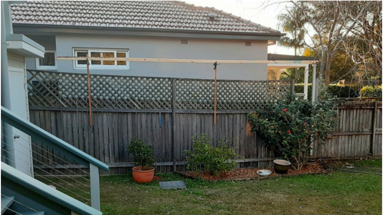
photo 2 .showing height to top of boxed gutter with fascia . Present height of fence from my garden bed level including lattice is 2200mm and with a further 450mm to horizontal timber level