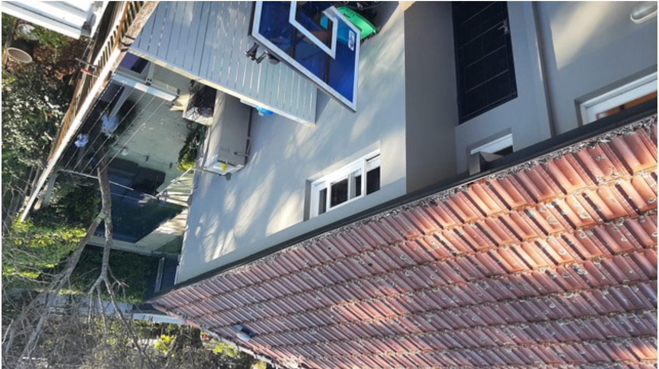
Photo 4 . Note build up of leaves in gutter from nearby very large Eucalyptus tree . Water regularly floods over here during heavy rain . Even unblocked there is only 1 down pipe on this side of the house and they will have ongoing problems if they were to build below