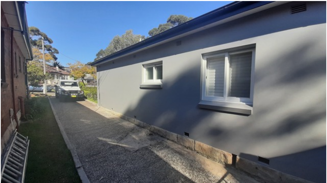
Photo 5. Archer's bedroom window which would be over shadowed in current proposal by a garage door immediately to the right of window . If carport were situated at southern street end and to the left of window that would allow more light for his room .