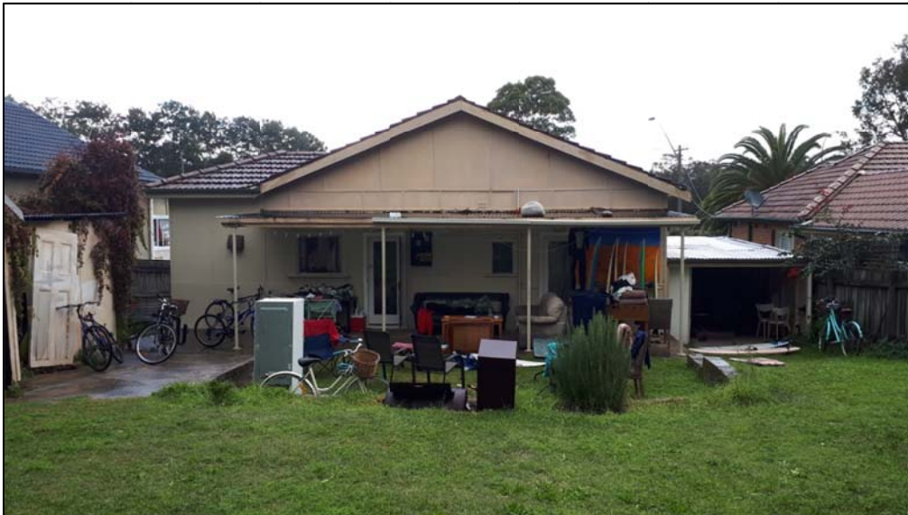
Plate 3: Rear view of the site house, looking south