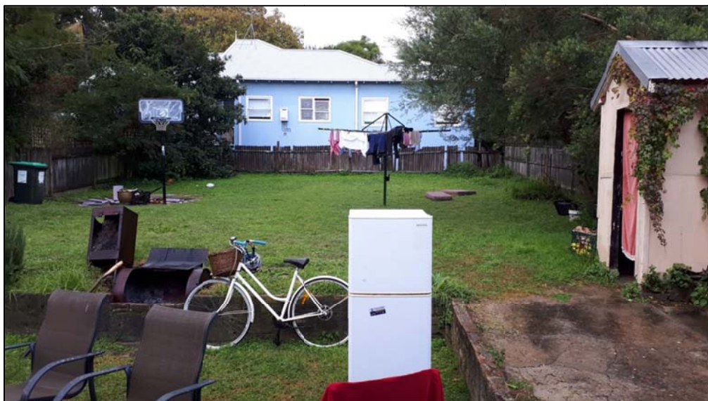
Plate 4: A view of the back yard, looking north