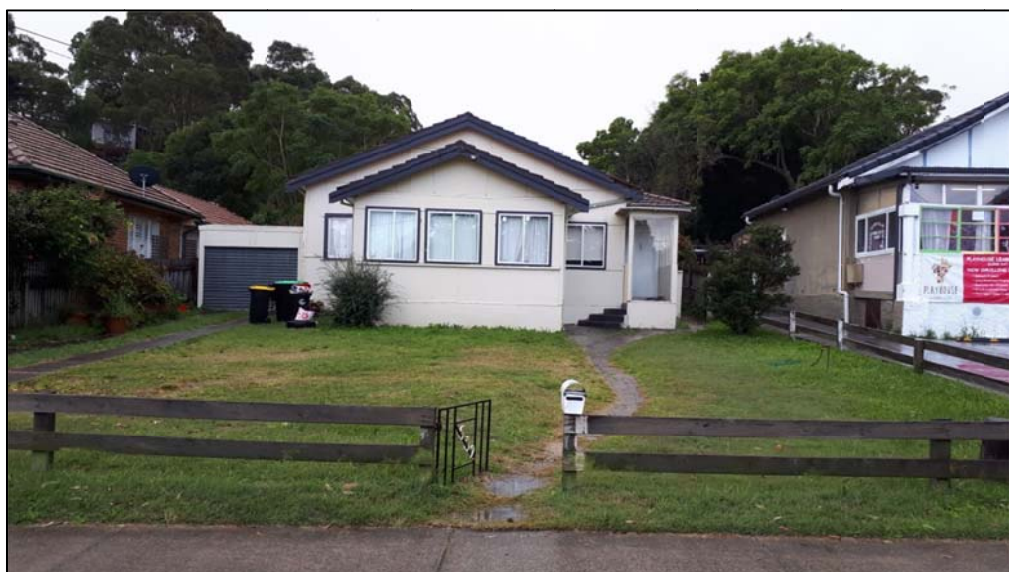
Plate 2: Front view of the site house, looking north