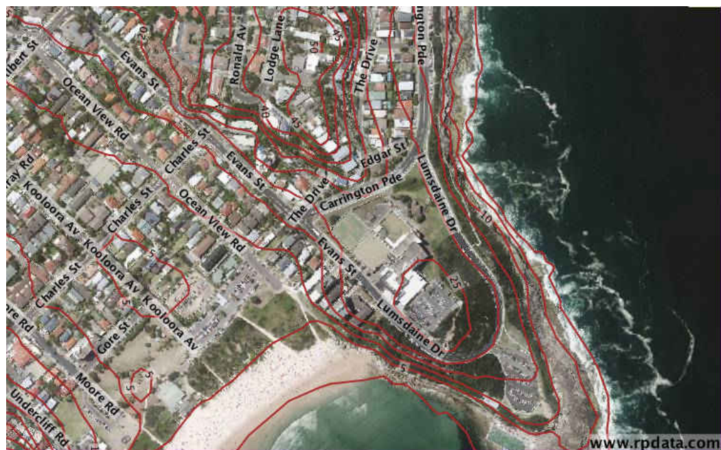
Site with 5m contour overlay

The subject site is located within the Harbord Diggers Club site on the southern side of Carrington Parade and the northern side of Evans Street and bounded by Lumsdaine Drive.