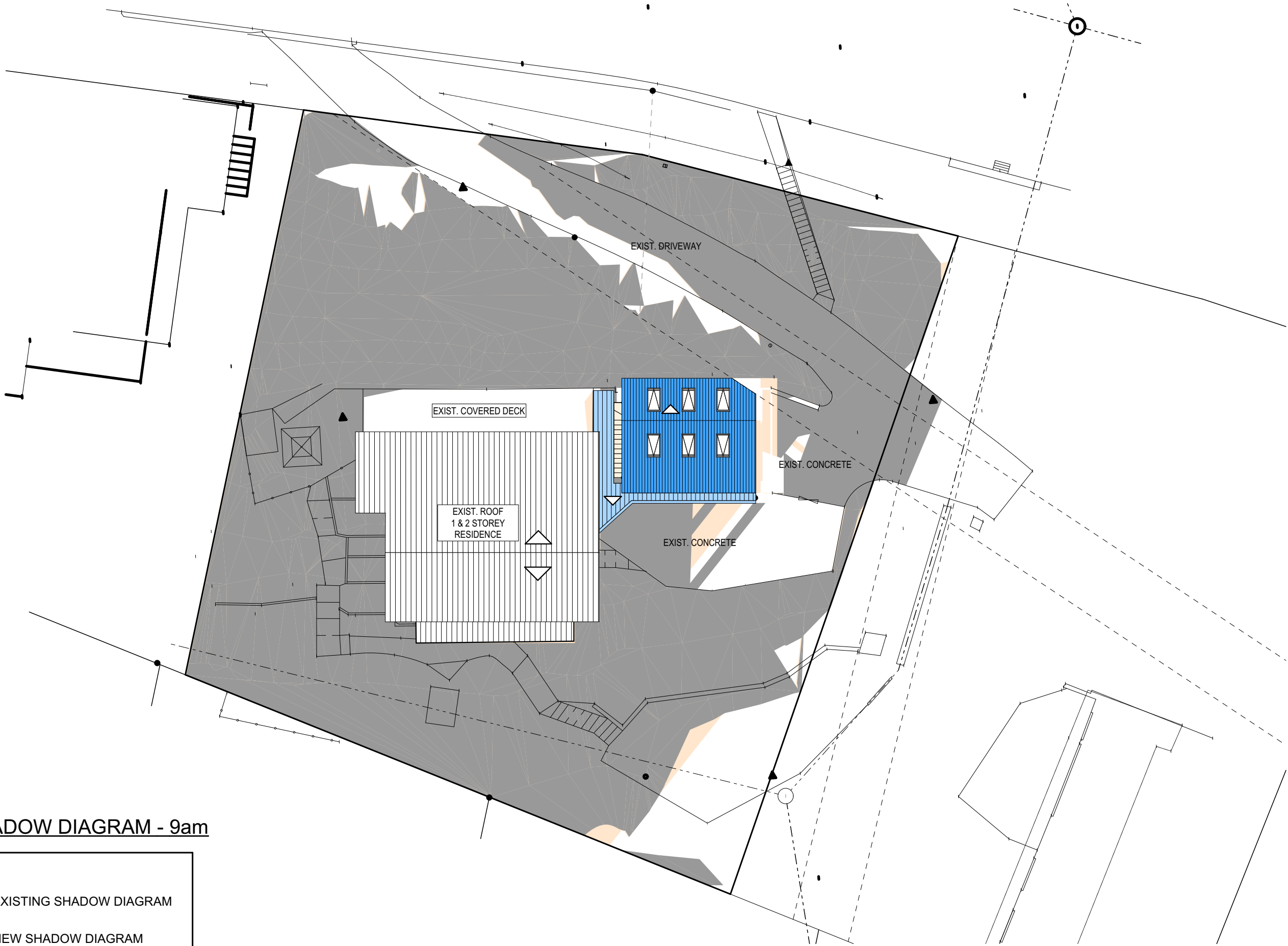
21 JUNE SHADOW DIAGRAM - 9am