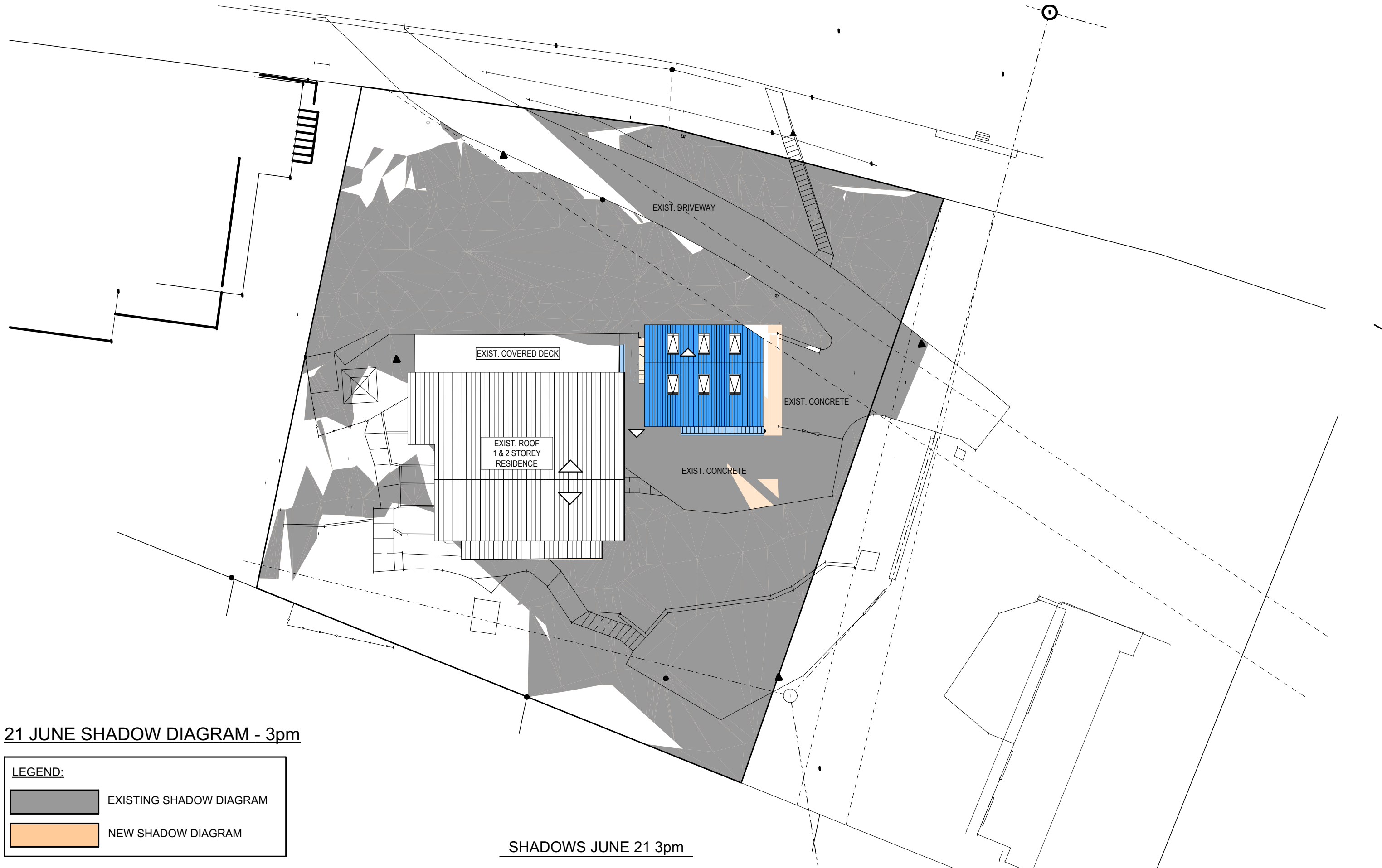
21 JUNE SHADOW DIAGRAM - 3pm