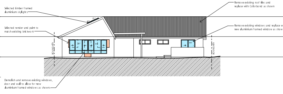
4 EAST ELEVATION 1:100