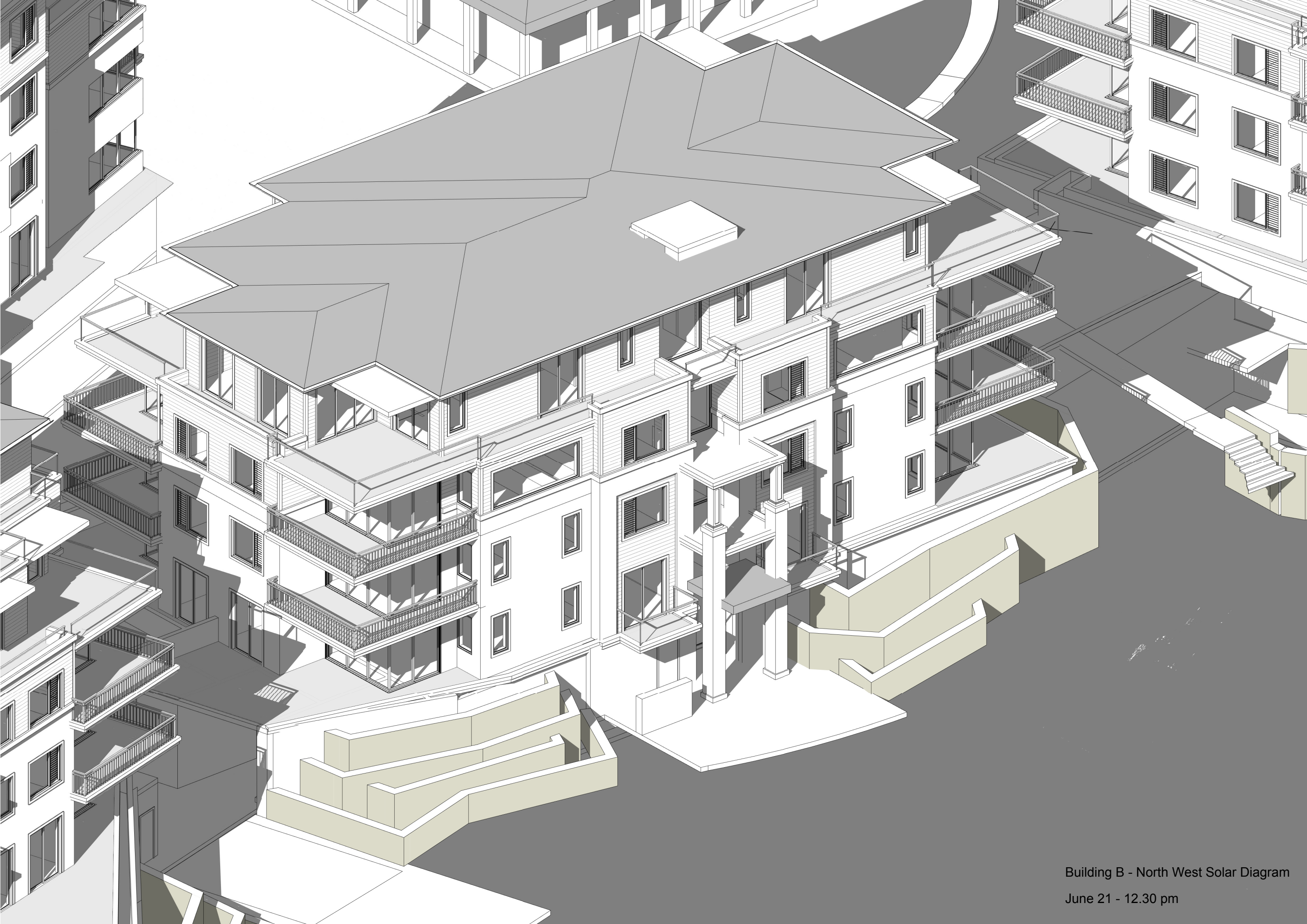
Building B - North West Solar Diagram June 21 - 12.30 pm