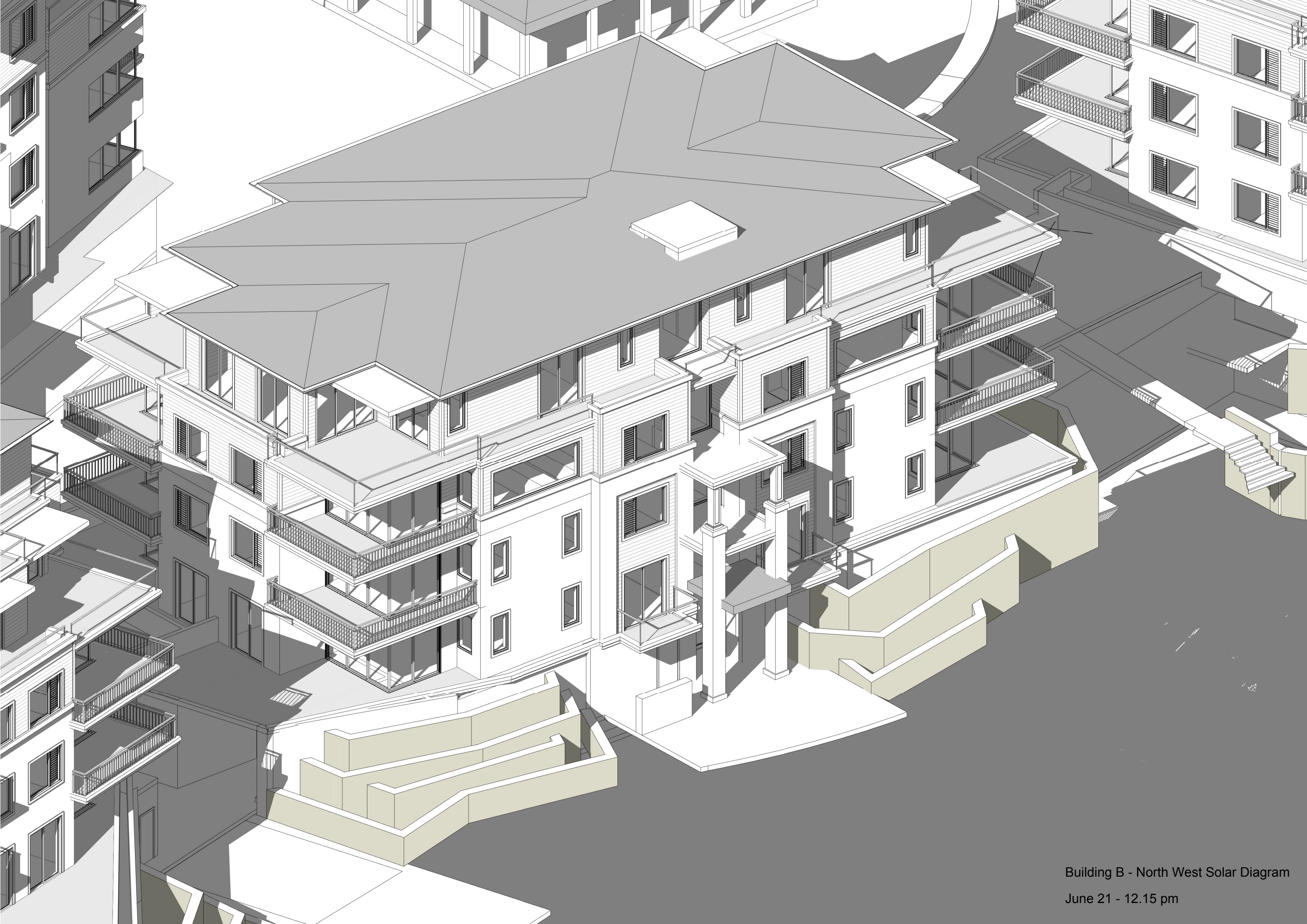
Building B - North West Solar Diagram