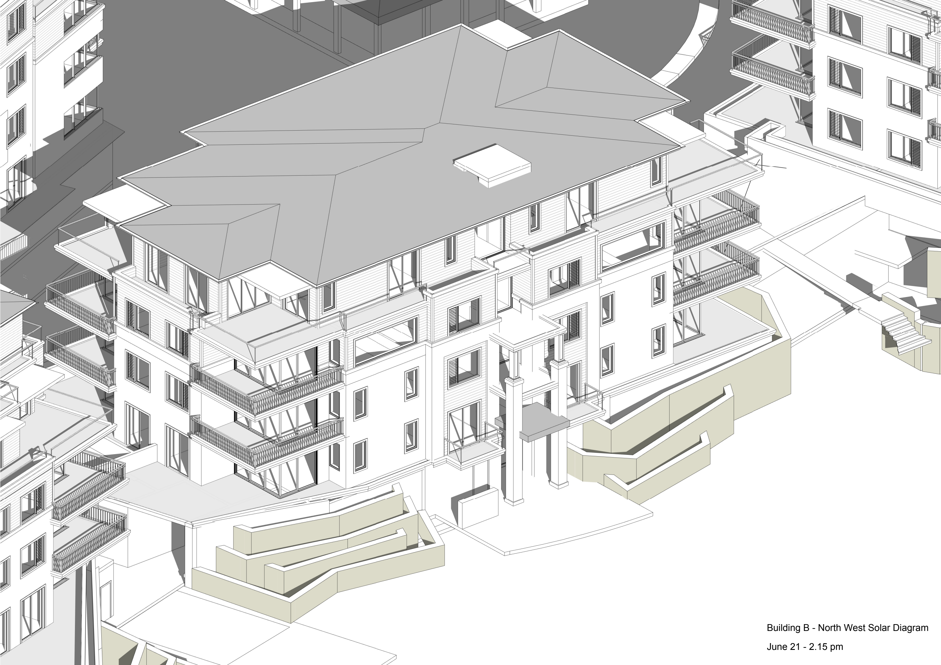
Building B - North West Solar Diagram June 21 - 2.15 pm