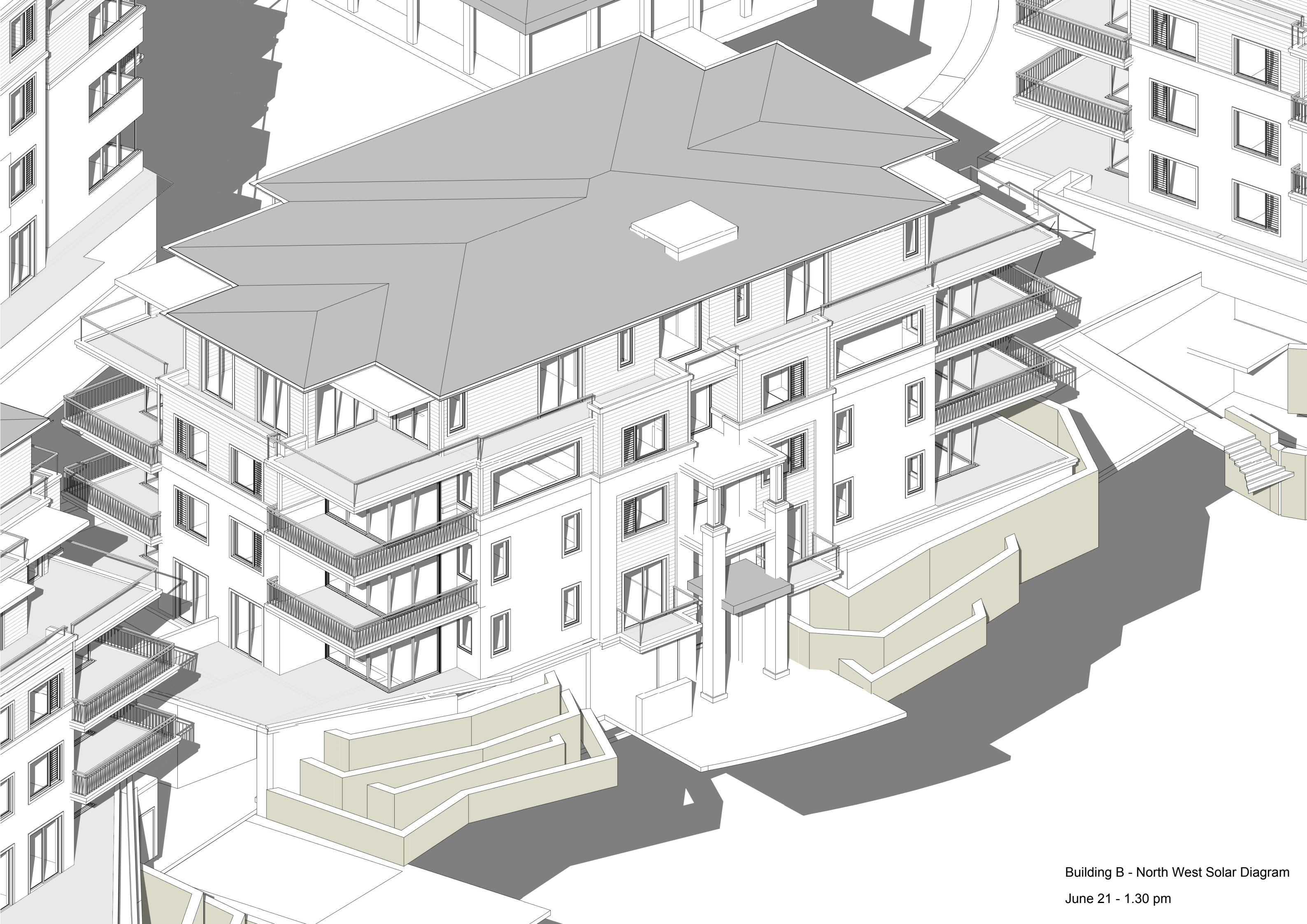
Building B - North West Solar Diagram June 21 - 1.30 pm