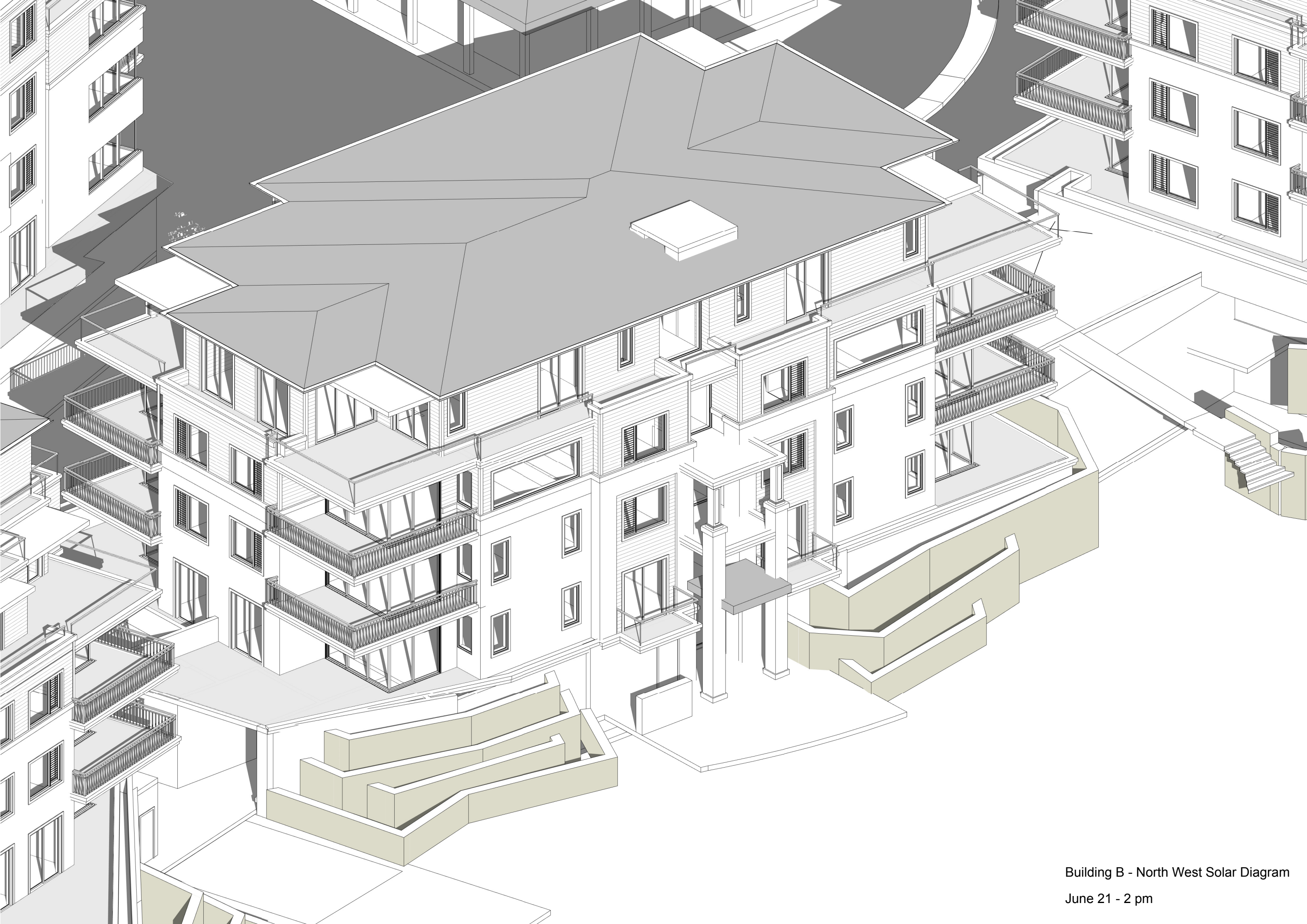
Building B - North West Solar Diagram June 21 - 2 pm