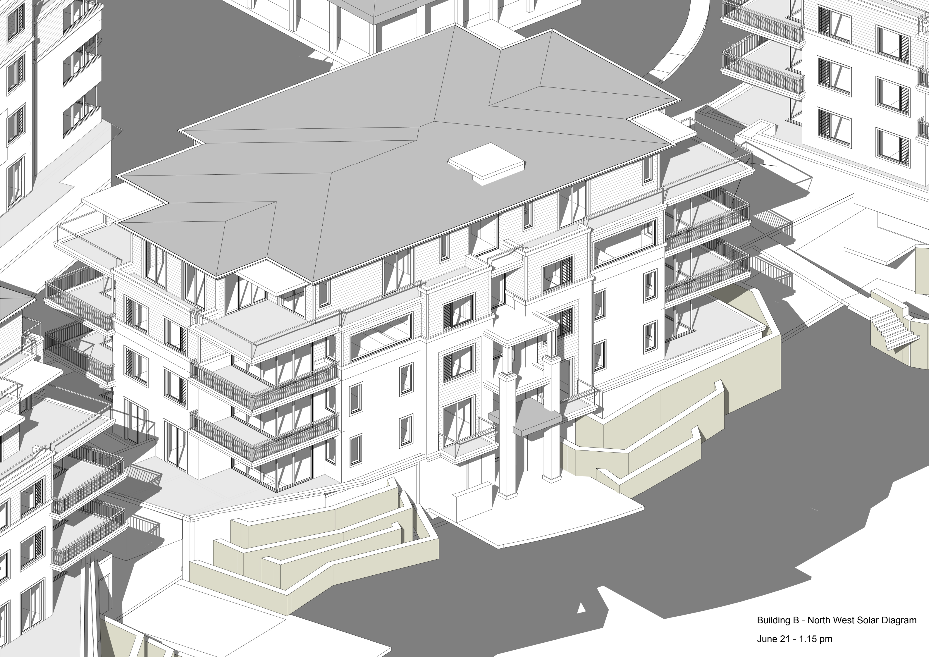
Building B - North West Solar Diagram June 21 - 1.15 pm