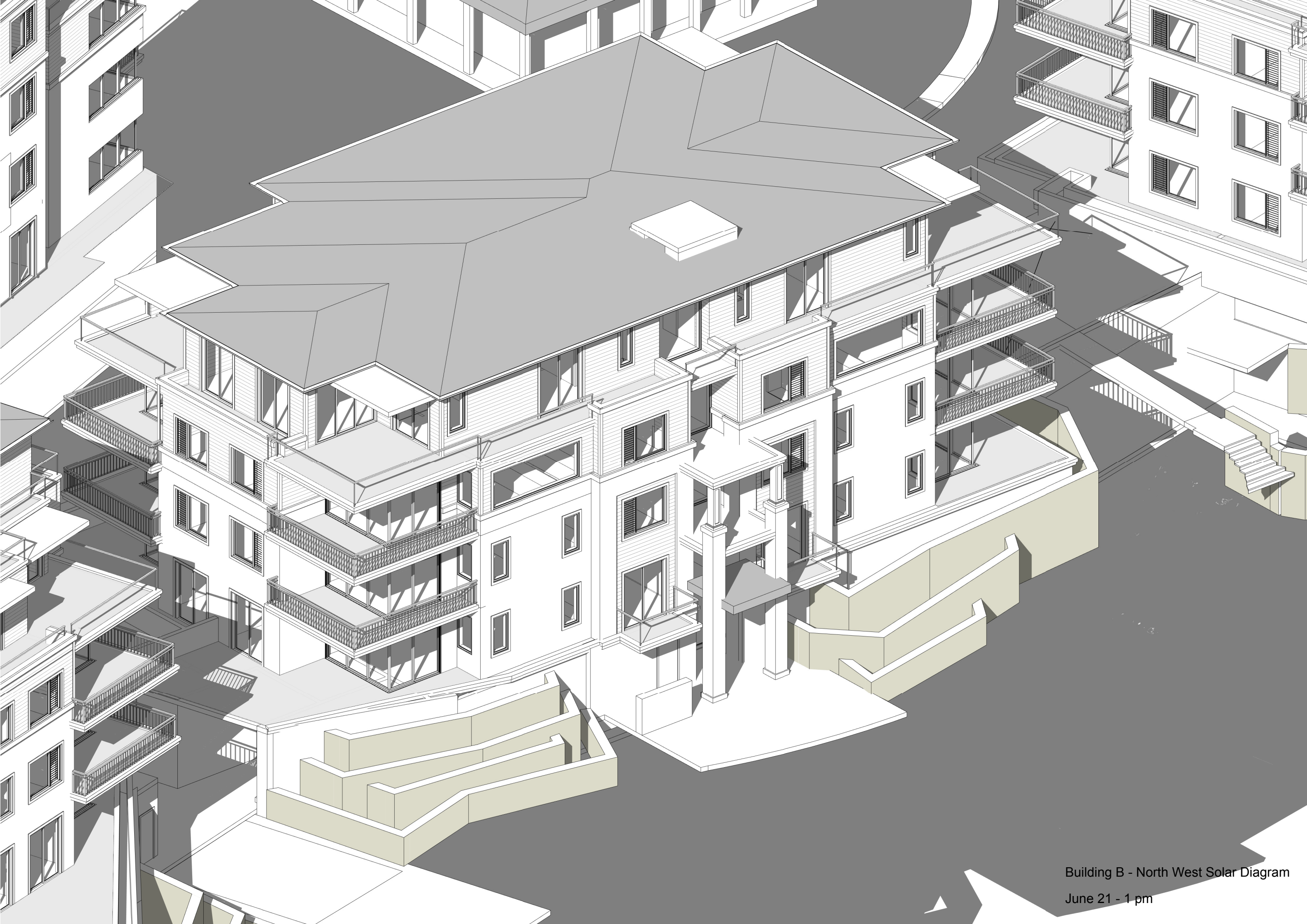
Building B - North West Solar Diagram June 21 - 1 pm