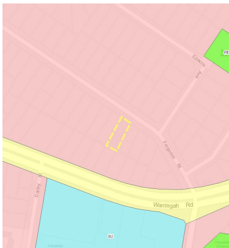
Zoning Map 11 Ferguson Street , Forestville NSW R2 : Low Density Residential

The site is zoned R2 under the Warringah Council LEP 2011 (WLEP 2011). The proposed use is Low Density Housing