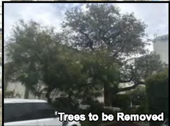
Trees to be Removed