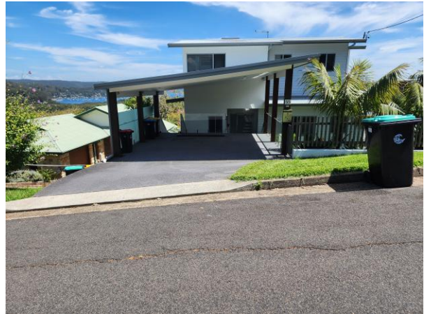
Existing driveway, looking North West