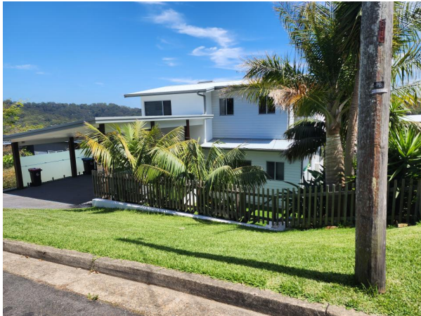
Subject site, looking North West