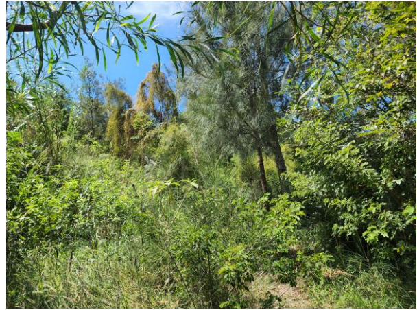
Typical regrowth vegetation