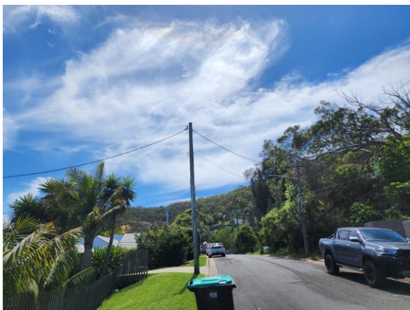
Above ground electrical supply