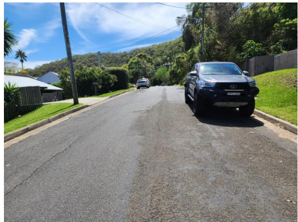
Binburra Avenue, looking North East