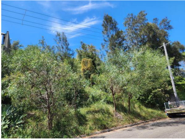
Public Reserve, regrowth vegetation, looking South East