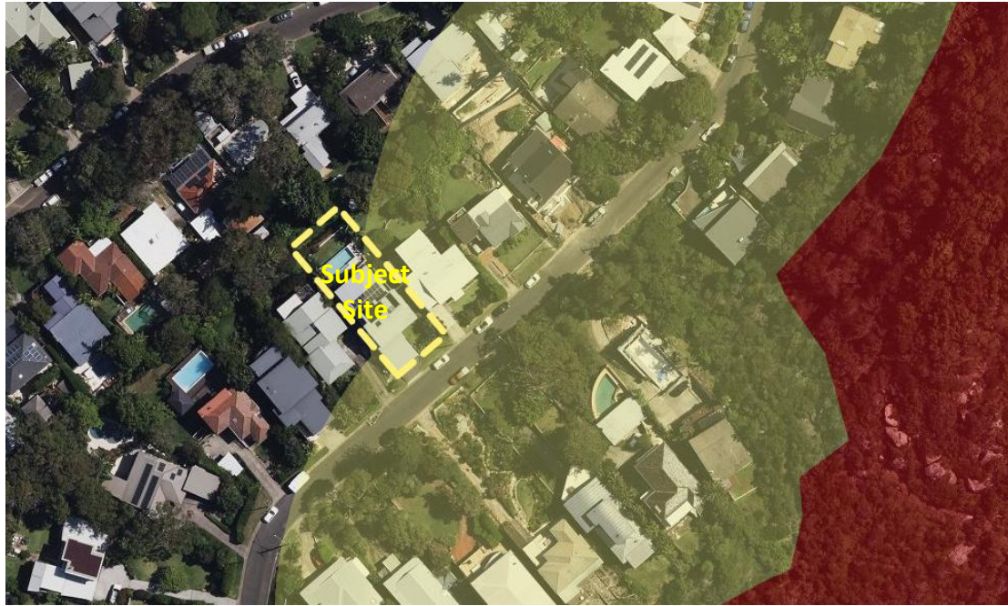
Extract Northern Beaches Council LGA Bushfire Prone Land Map