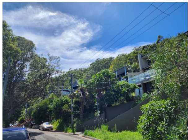
Forest vegetation, beyond adjacent residential, looking North