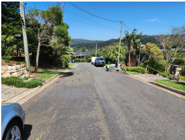
Binburra Avenue, looking South West