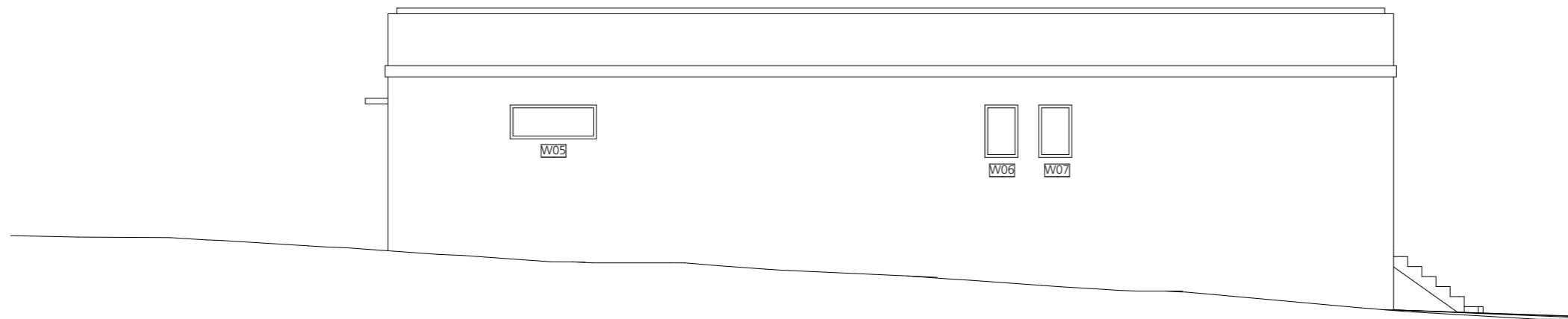
02 WEST ELEVATION 1:100