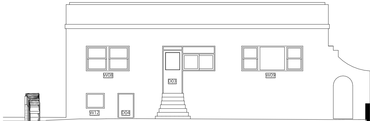
02 - SOUTH ELEVATION 1:100