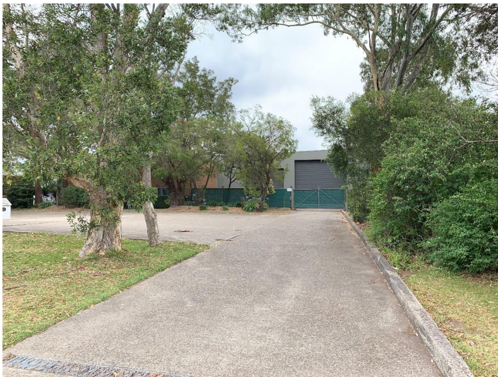
Fig 3: View of subject unit, looking west from Myoora Road