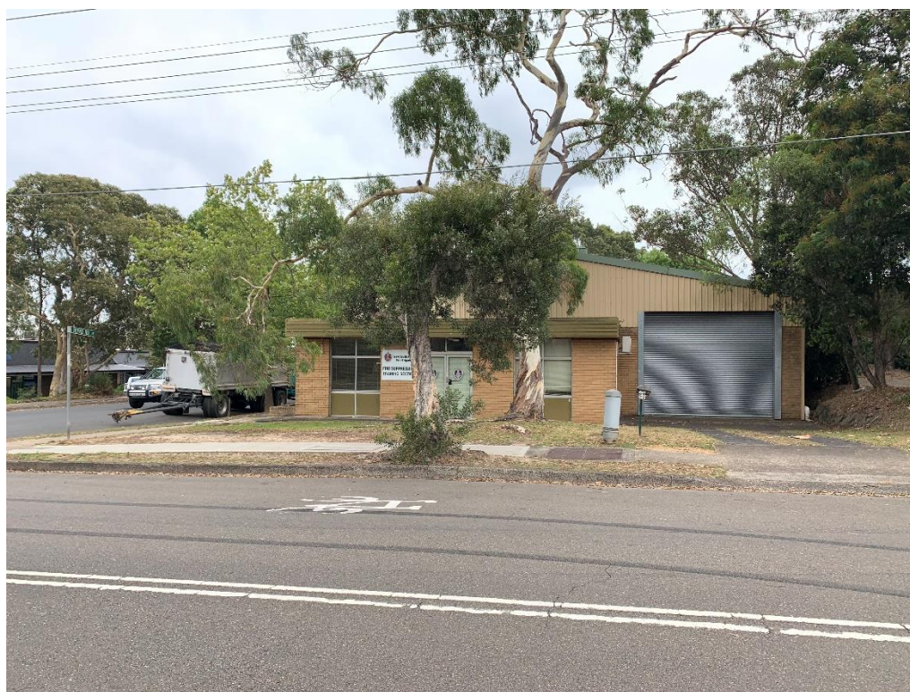
Fig 6: View of adjoining site at No 55 Myoora Road, looking west from Myoora Road