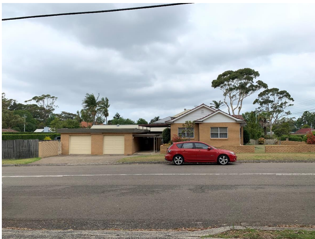
Fig's 6 & 7: View of existing residential properties opposite on the eastern side of Myoora Road looking east