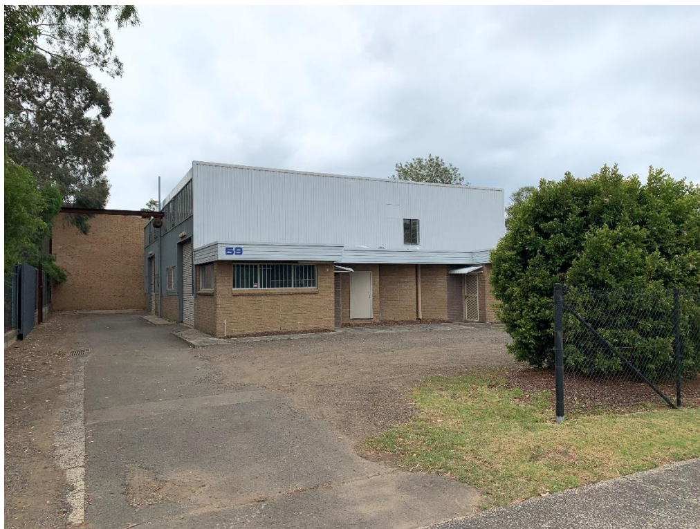
Fig 5: View of adjoining site at No 59 Myoora Road, looking north-west from Myoora Road