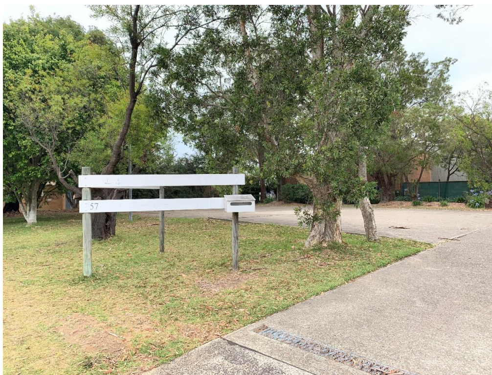
Fig 4: View of entry driveway and location of existing signboard, looking north-west from Myoora Road