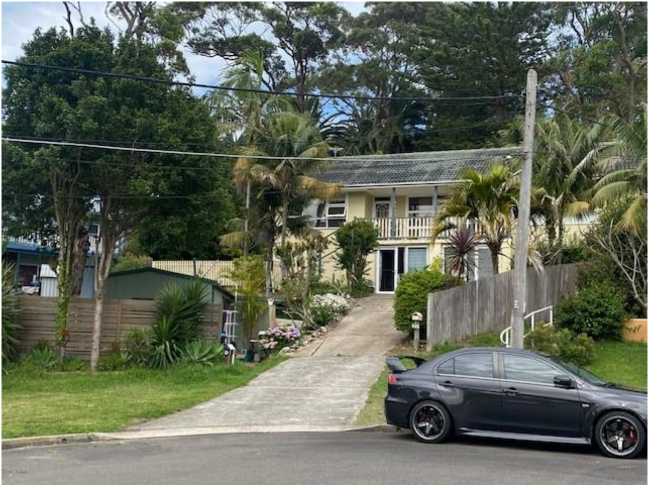
Figure 2: The subject site Grenfell Avenue frontage