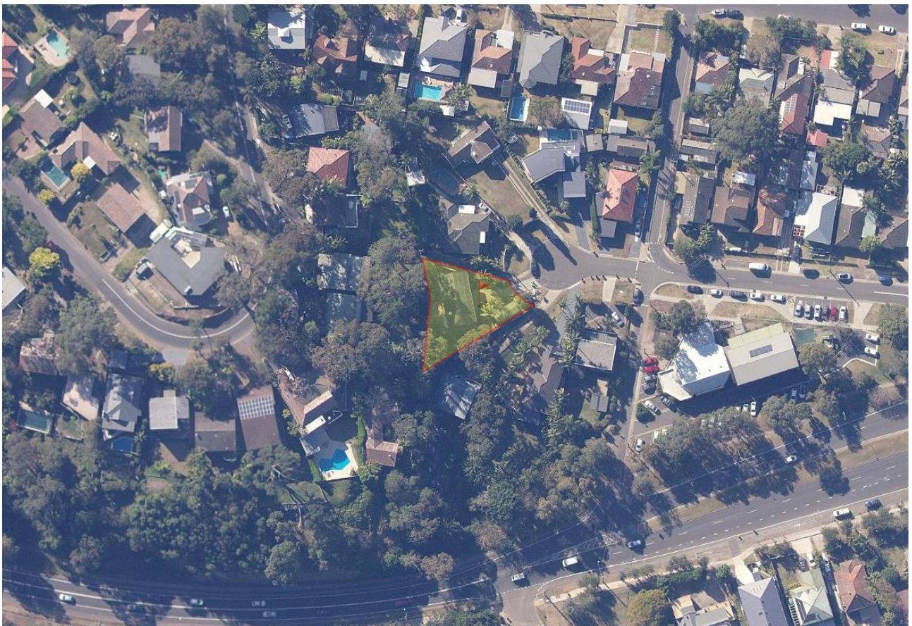
Figure 1: The site

The site is identified in Figure 1 of this SEE.