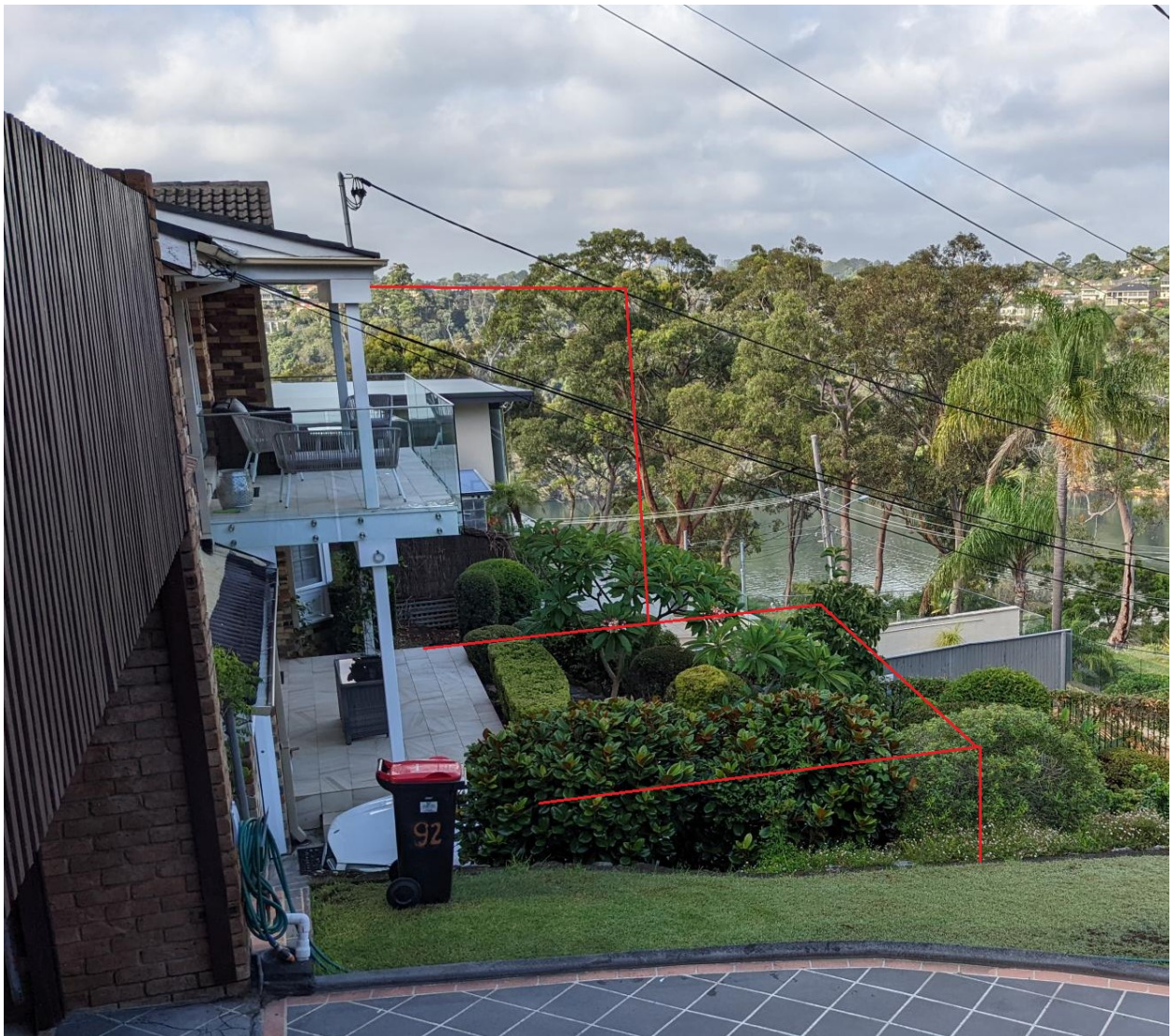
Image showing the approximated worst view impact.