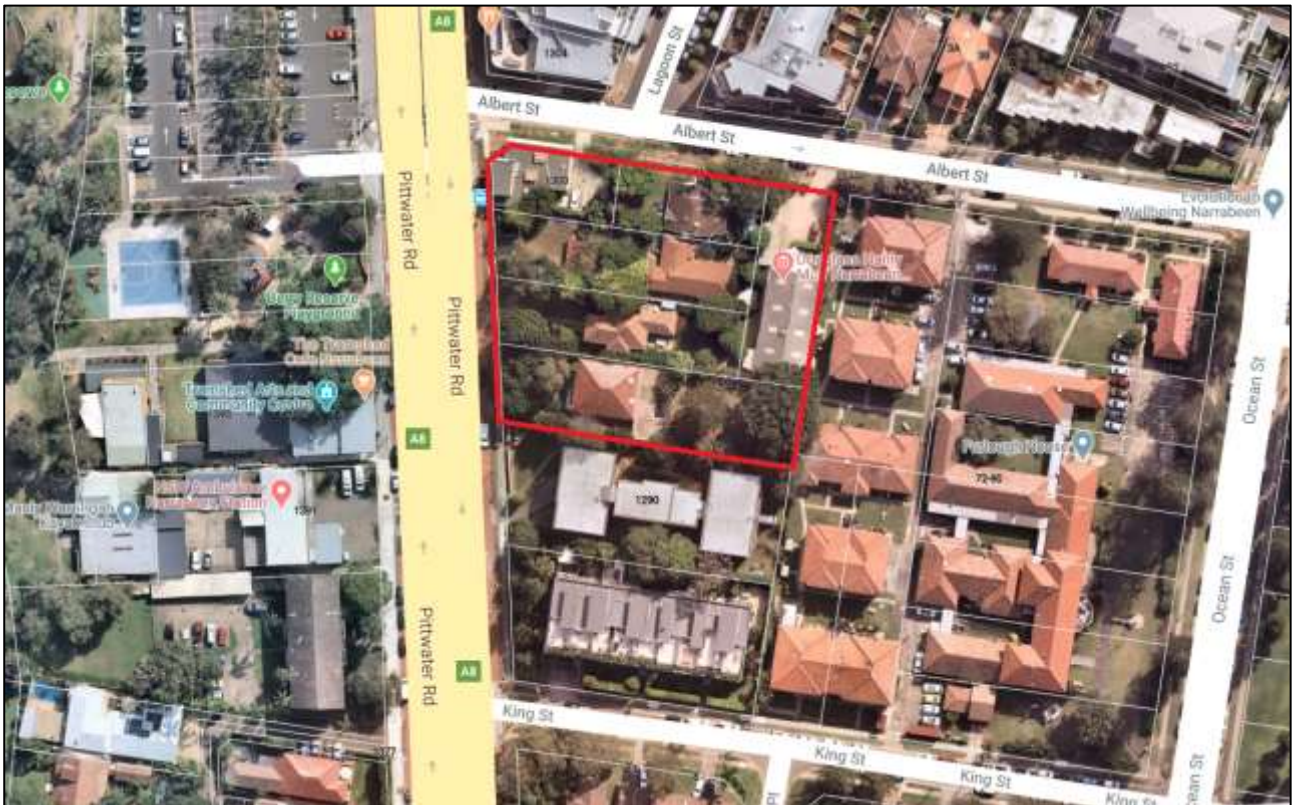
Figure 1: The subject site indicated in red

The subject site at 1294-1300 Pittwater Road and 2-4 Albert Street, Narrabeen comprises six lots as depicted in Figure 1.