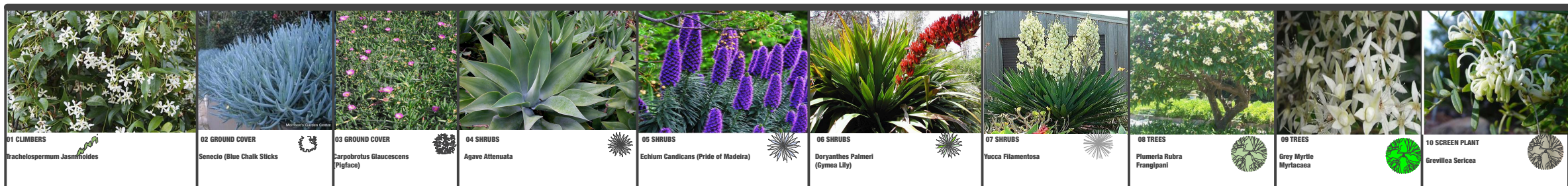
INDICATIVE PLANT SELECTION

PLANTING TO BE IN ACCORDANCE WITH PITTSWATER COUNCIL NATIVE PLANT LIST. ANY PLANTS ON THE PITTSWATER COUNCIL NOXIOUS PLANT LIST TO BE REMOVED. ALL WORKS TO BE CARRIED OUT IN ACCORDANCE WITH REQUIREMENTS OF THE BUILDING CODE OF AUSTRALIA. PRIOR TO COMPLETION OF WORKS, ALL DECLARED NOXIOUS WEEDS ARE TO BE REMOVED AND CONTROLLED IN ACCORDANCE WITH THE NOXIOUS WEEDS ACT 1993 ANY VEGETATION PLANTED ONSITE OUTSIDE THE APPROVED LANDSCAPE ZONES IS TO BE CONSISTENT WITH PITTSWATER COUNCIL NATIVE PLANT LIST ALL EXISTING TREES AS APPROVED TO BE RETAINED MAY ONLY BE REMOVED WITH COUNCILS CONSENT