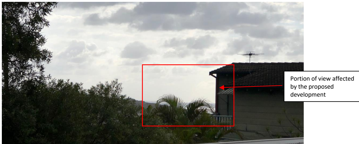
Figure 3: The affected view from No. 24 Seaview Avenue

It is considered the views obtained from No. 42 Seaview Avenue will not be impacted by the proposal as the view is obtained along Gardere Avenue and the proposed works will not alter this view.