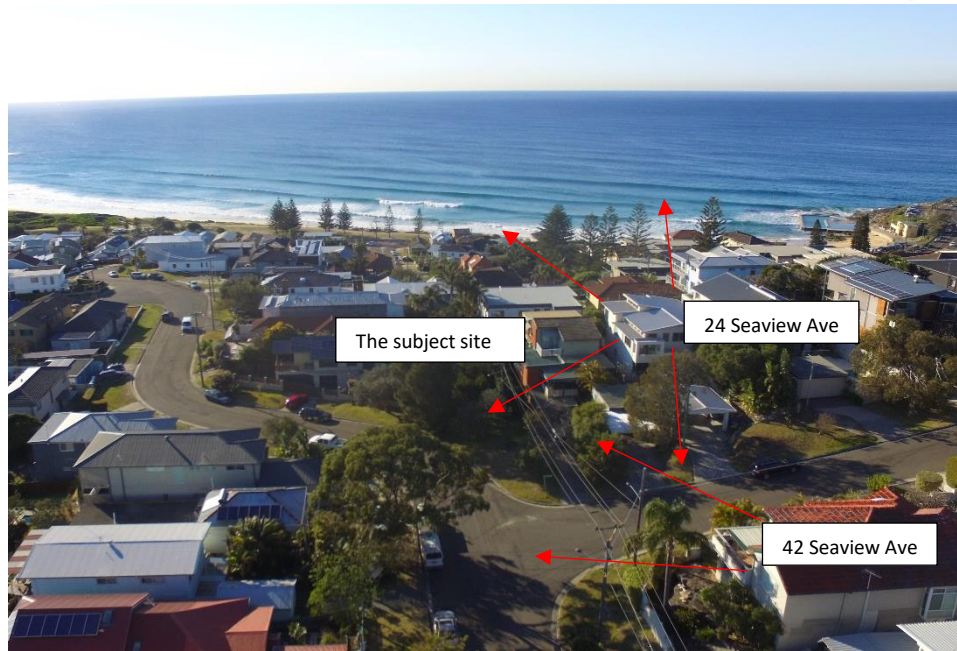
Figure 2: Drone image identifying the subject site and properties subject to this assessment (looking east).