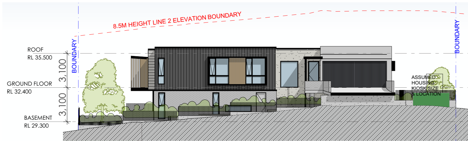
3 WEST ELEVATION 1:200

NOTE 8.5 M. DASHED HEIGHT LINE IS DRAWN STANDING AT BOUNDARY WHERE EACH ELEVATION IS TAKEN REFER TO SECTIONS A&B FOR THE 8.5 M. DASHED HEIGHT LINE LIMIT