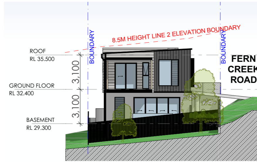
2 NORTH ELEVATION 1:200

NOTE 8.5 M. DASHED HEIGHT LINE IS DRAWN STANDING AT BOUNDARY WHERE EACH ELEVATION IS TAKEN REFER TO SECTIONS A&B FOR THE 8.5 M. DASHED HEIGHT LINE LIMIT