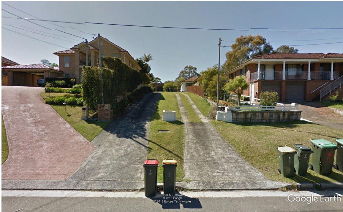
Subject Site as viewed from the street

With regards to topography the subject site has a gradual fall from the rear boundary to Davidson Avenue.