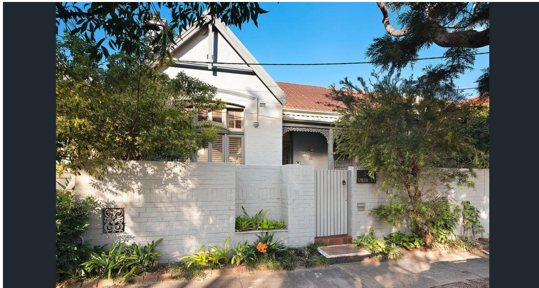
Figure 2: Existing Frontage.

The locality is considered a general residential area. An important characteristic and element of Manly significance as a garden suburb is the garden setting of its houses, and the flow of garden space around and between its houses.