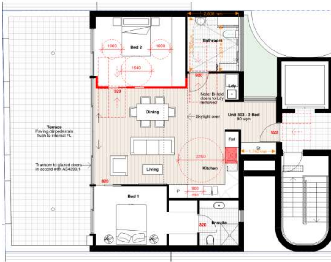
Figure 1 - Unit type 1 (pre-adaptation)