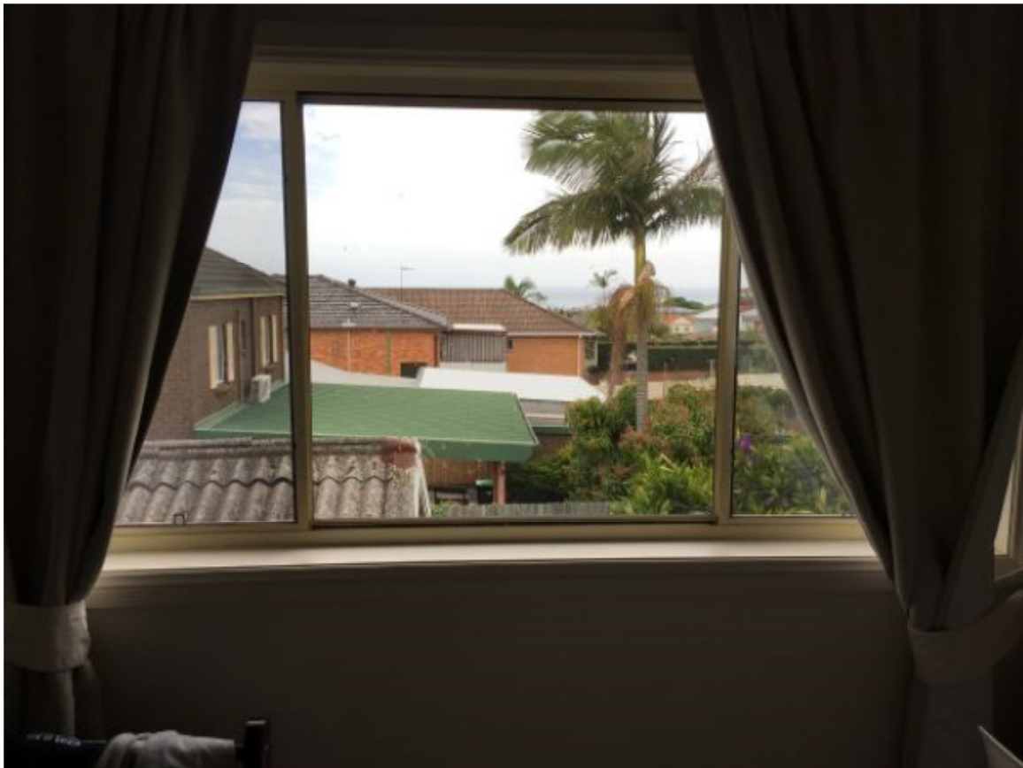
View from first floor bedroom look east to the distant ocean

The view loss is considered minor given the distant (2kms) where the ocean is located from the site (No.25 Greenwood Avenue) and view is over a side boundary (eastern).