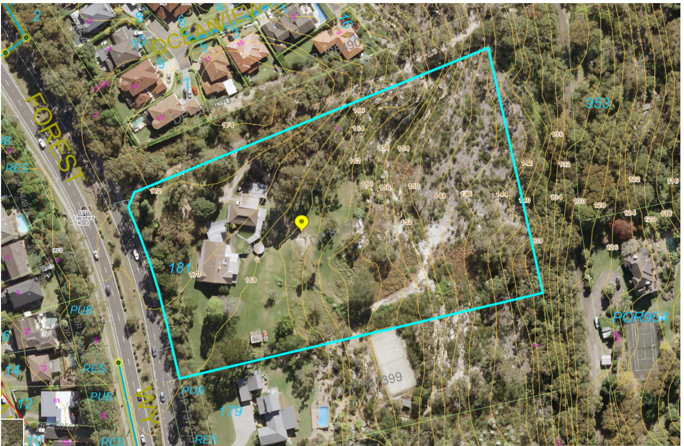
Figure 1 – Subject Site