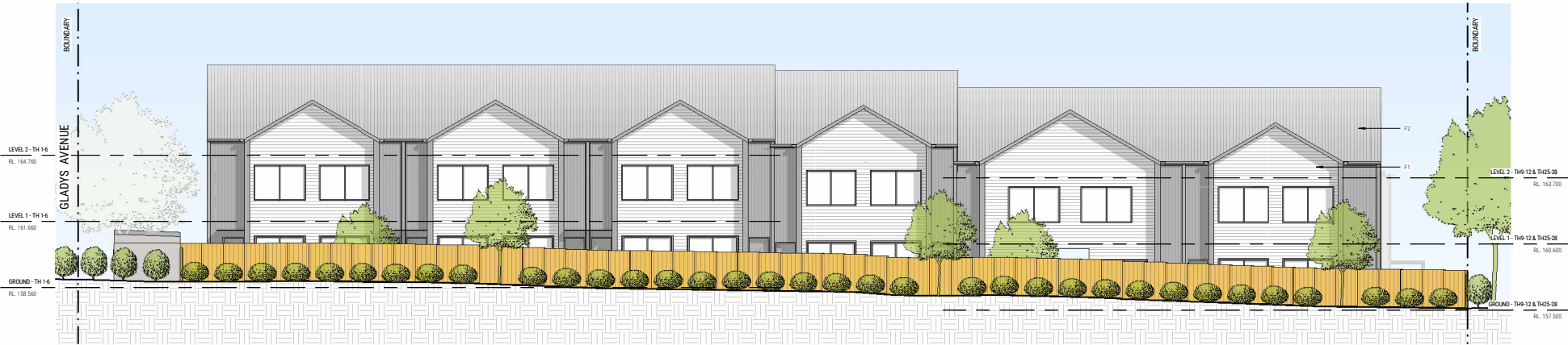
2 SOUTHERN ELEVATION - BUILDING A DA303 1:100 @ A1