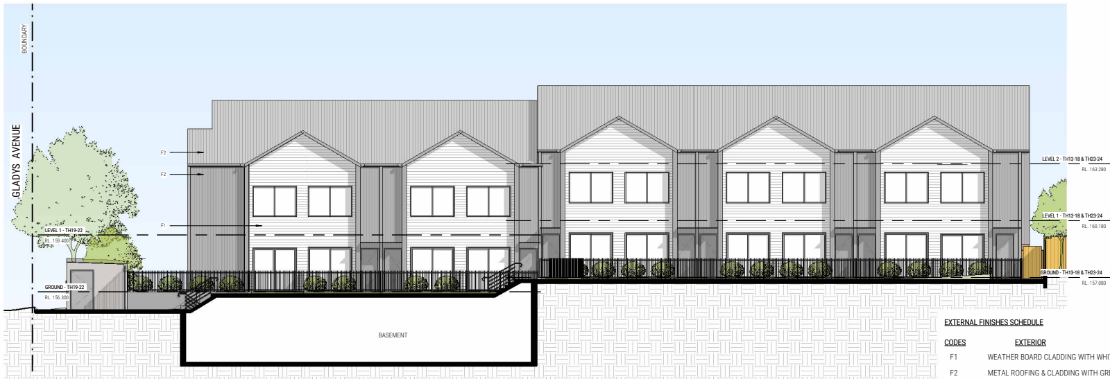
2 WESTERN ELEVATION BUILDING B SCALE: 1:100 @ A1