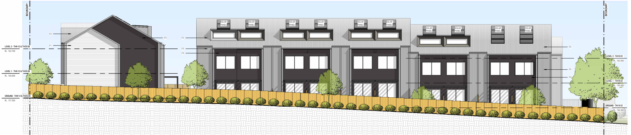
1 EASTERN ELEVATION - BUILDING A & B SCALE: 1:100 @ A1