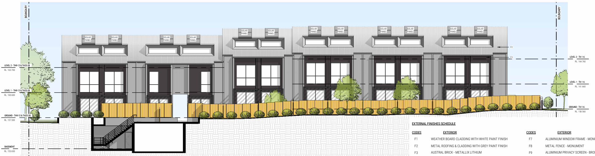
1 NORTHERN ELEVATION - BUILDING A DA303 1:100 @ A1