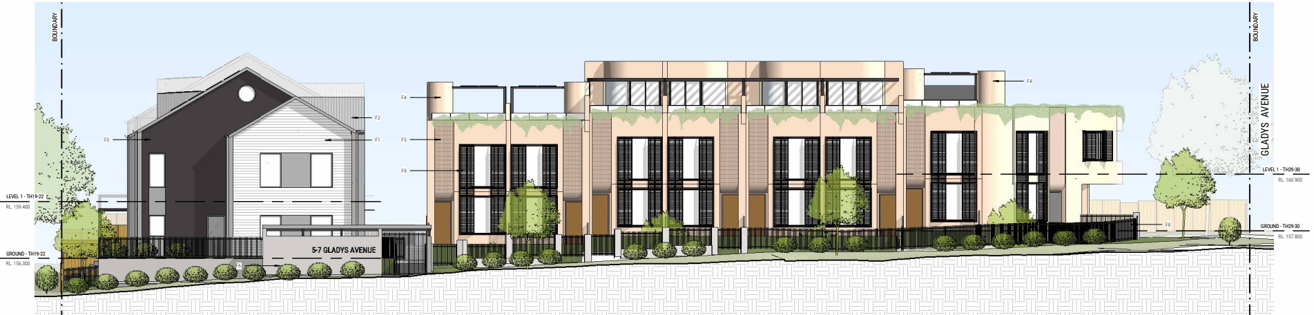
2 NORTHERN ELEVATION - BUILDING B & C 1:100 @ A1