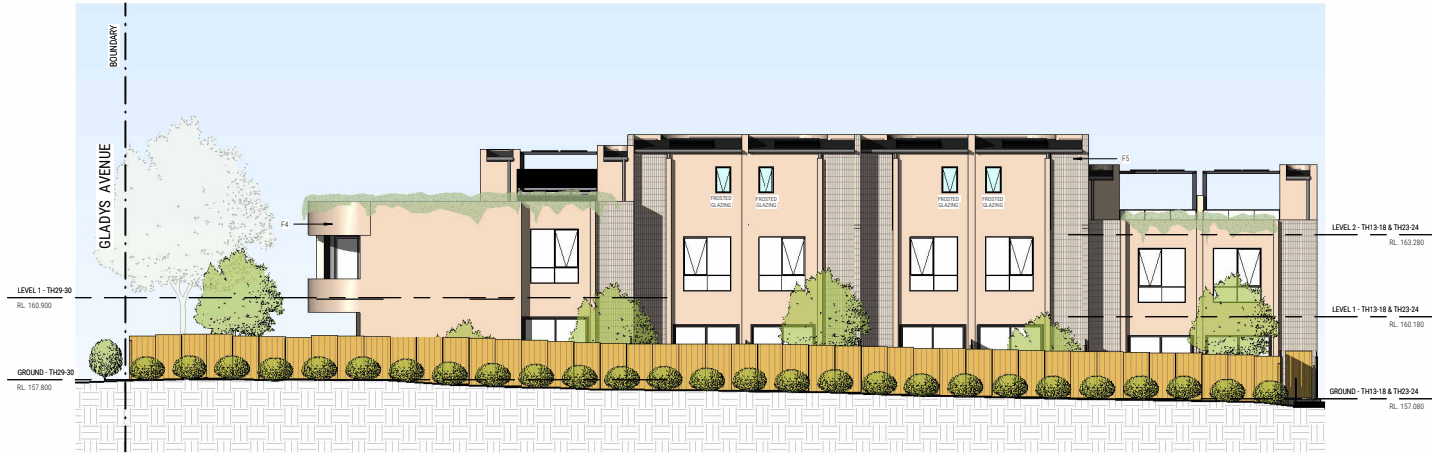
1 SOUTHERN ELEVATION - BUILDING C 1:100 @ A1