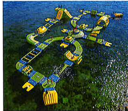
TYPICAL SPLASH PARK ARRANGEMENT