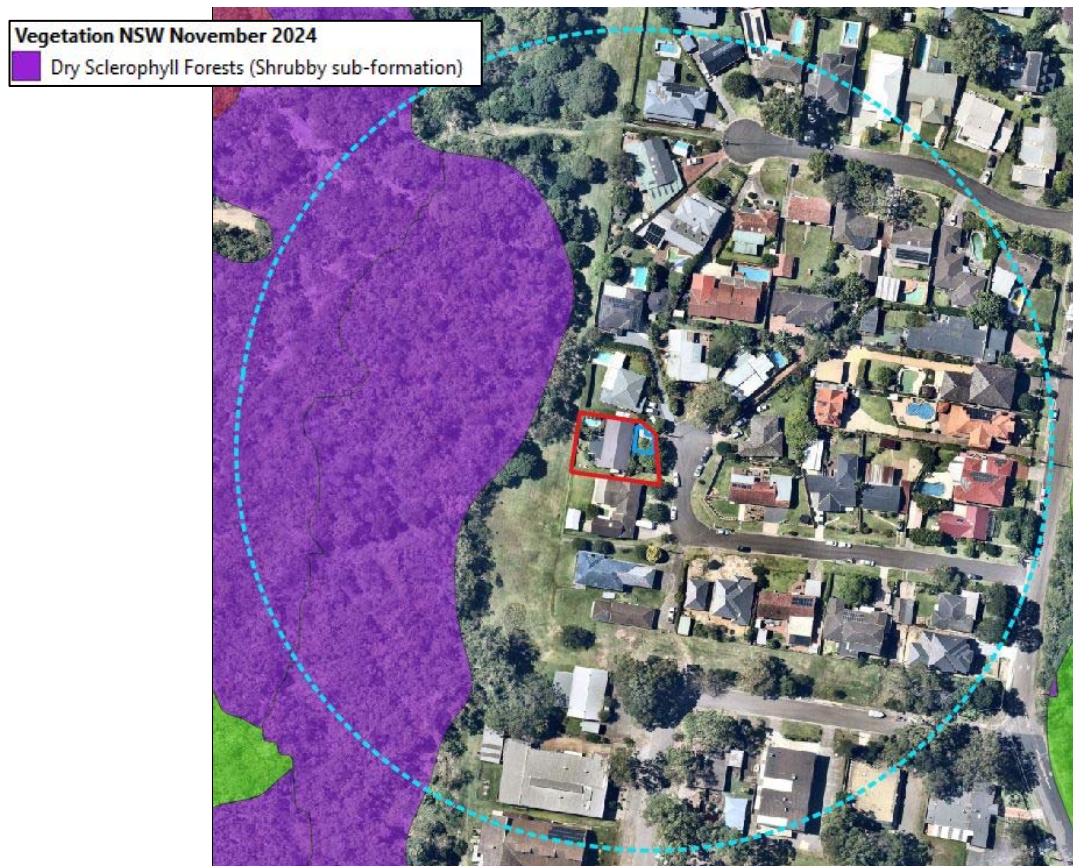
Figure 03: Aerial view of the subject area overlaid with vegetation mapping (Vegetation NSW)

For the purpose of assessment under Planning for Bush Fire Protection the vegetation posing a hazard to the west of the proposed works has been determined to be Forest.