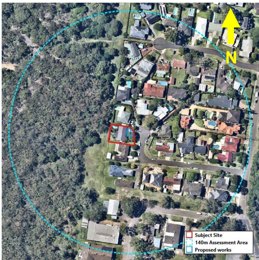
Figure 02: Aerial view of the subject area