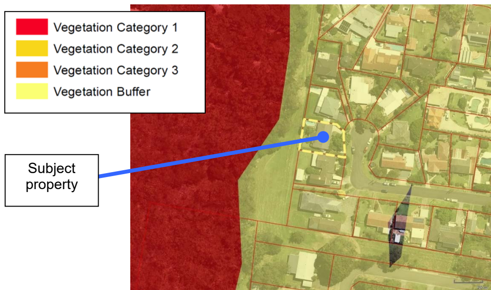
Figure 01: Extract from Northern Beaches Council's Bushfire Prone Land Map