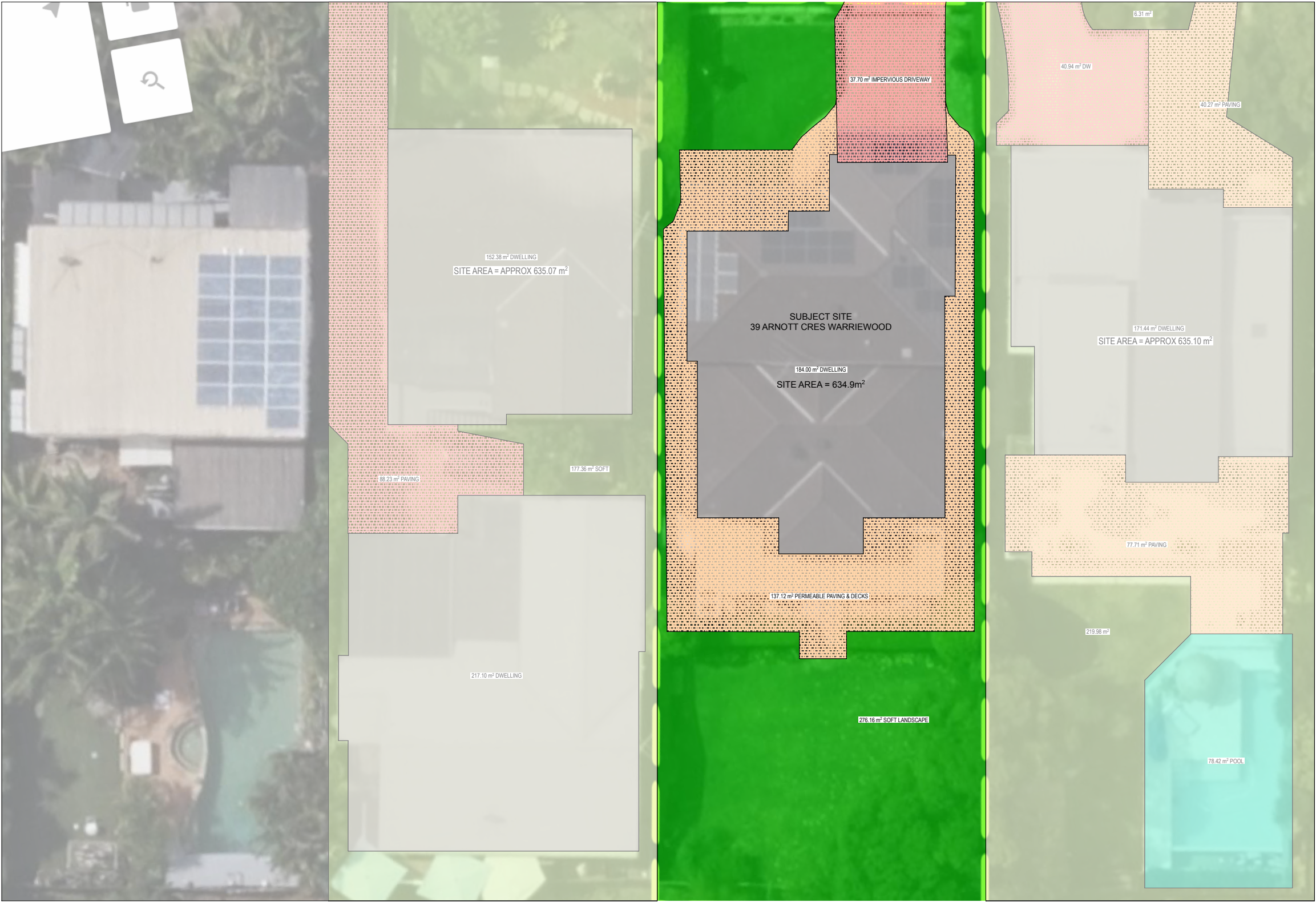
LSCP AREA EXT 1:200