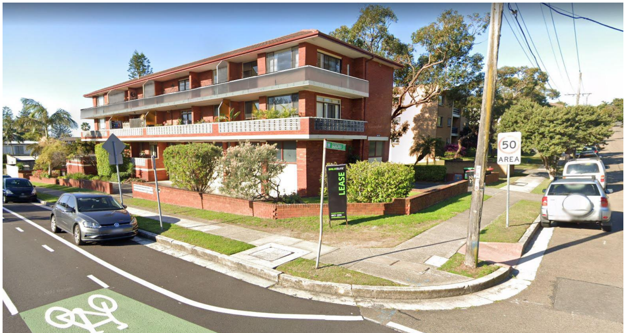
Photomontage – Proposed Development