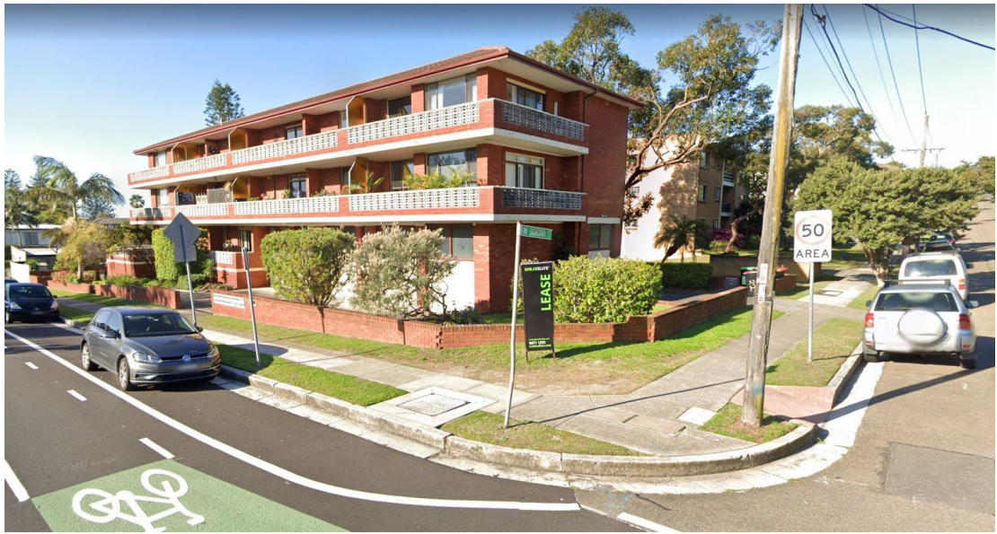
Photography – Existing Development