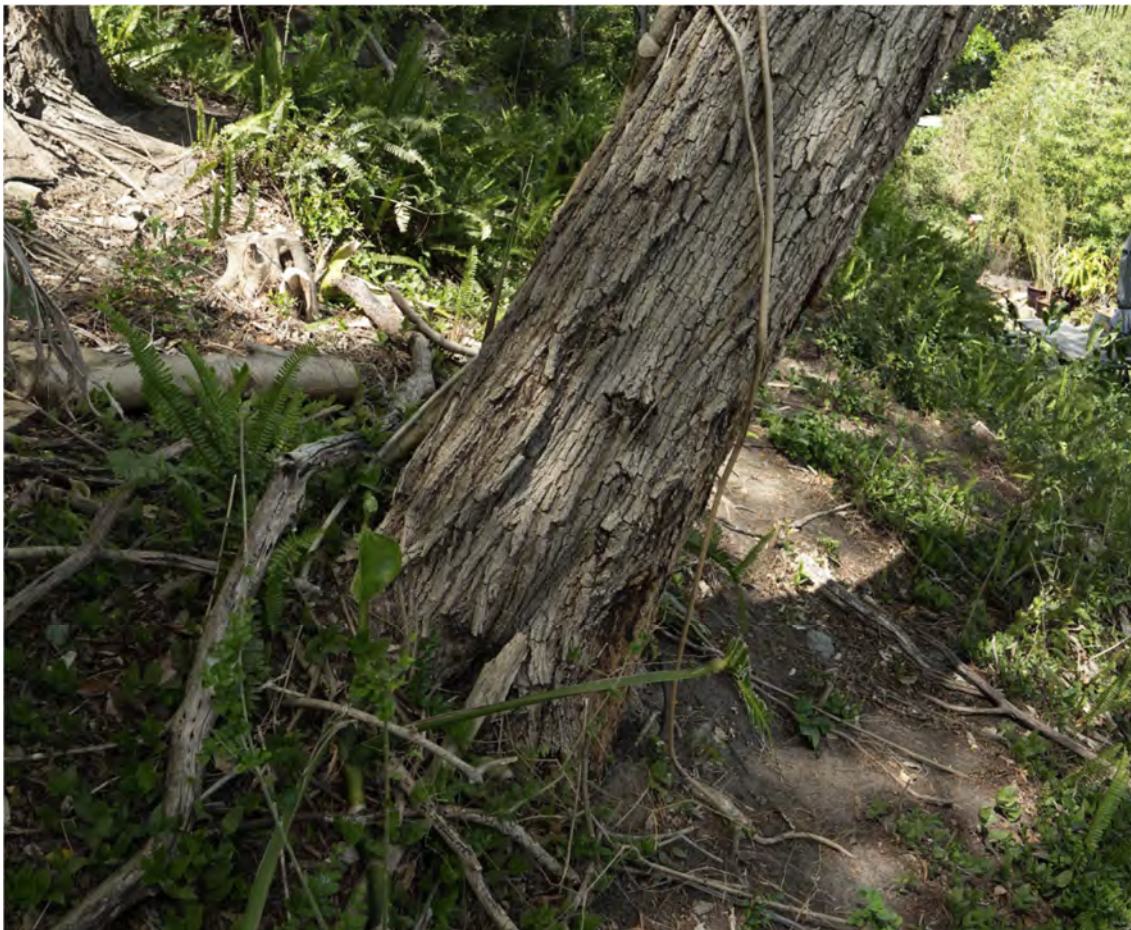
Image 3: The base of Tree 3 with exposed roots. Photograph was taken using the camera's on-board level to demonstrate the lean of the tree.