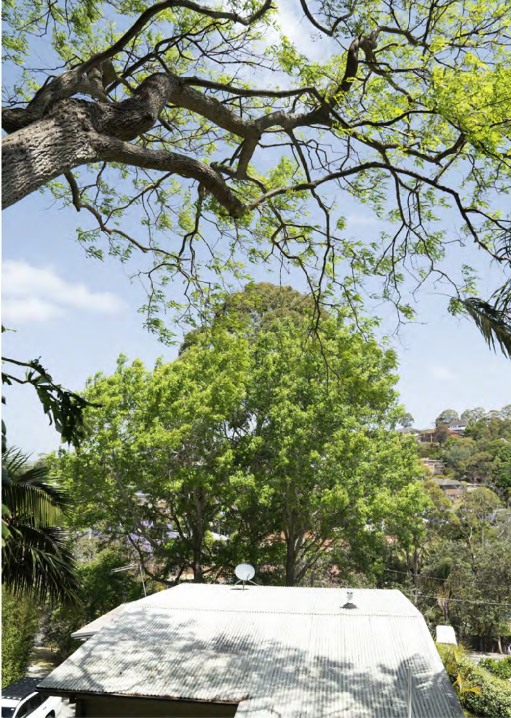
Image 1: Trees 1 & 2 [centre] located on the far side of the dwelling [bottom]. Foliage of Trees 3 & 4 [top] was arranged almost entirely above the existing dwelling.