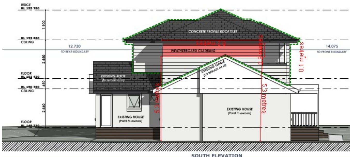
Figure 1.southern Elevation (red highlighting numerical building envelope non-compliance)

The proposal sits outside of the building envelope on the southern elevation. The encroachment with a maximum height of 0.9m for the length of 6.2m as demonstrated in the diagram below: