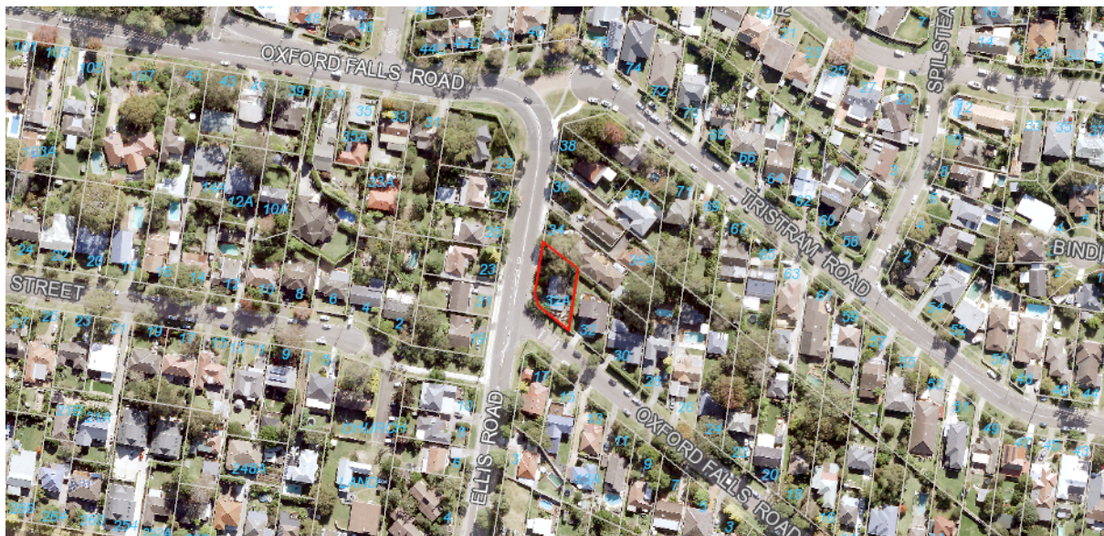
Image 2: Site location. 32a Oxford Falls Road NSW – Red Polygon (© NBC Maps)