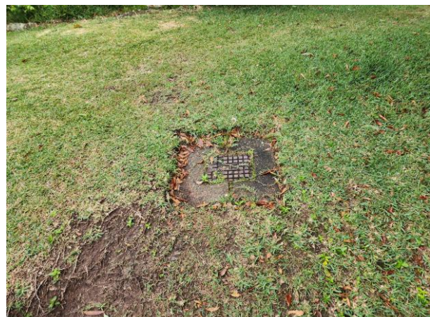
Reticulated water hydrant in pathway