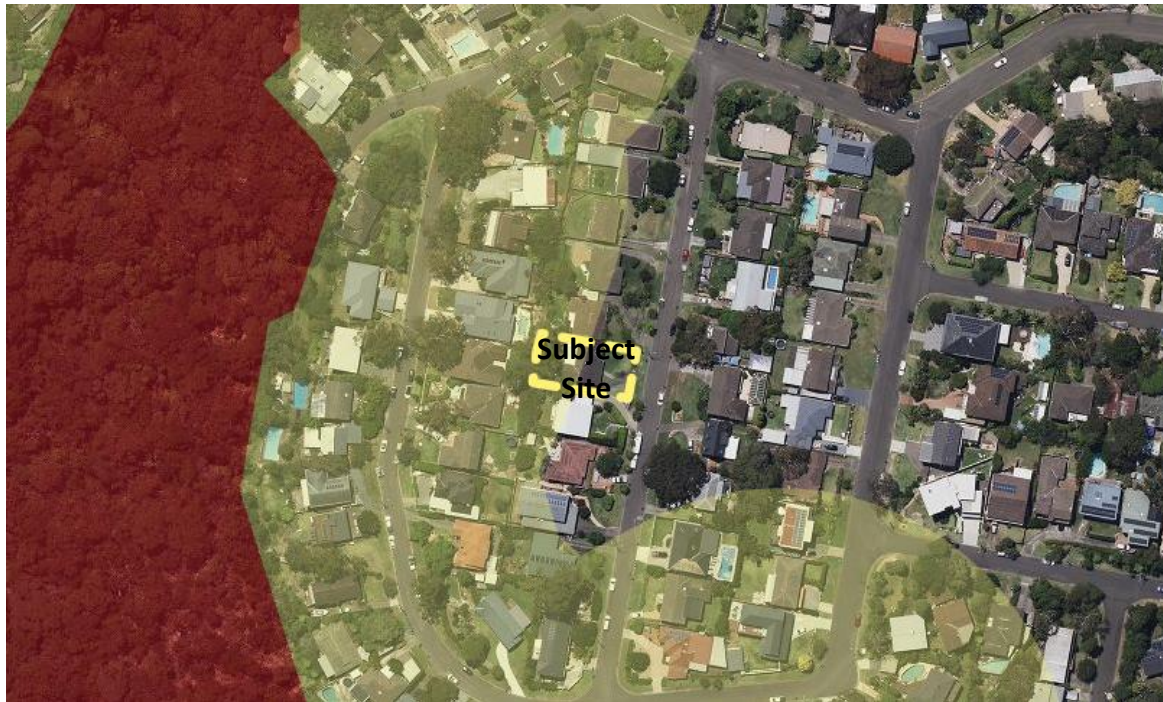
Extract Northern Beaches Council LGA Bushfire Prone Land Map