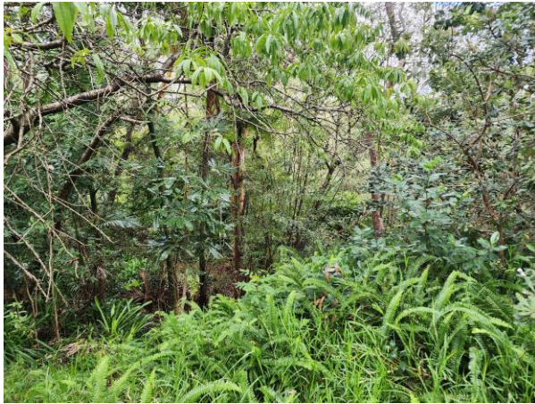
Bushfire vegetation, within reserve beyond adjacent residential, looking South West