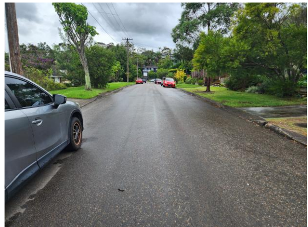
Warekila Road, looking North