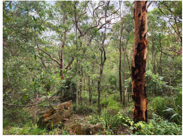
Bushfire vegetation, within reserve beyond adjacent residential, looking West