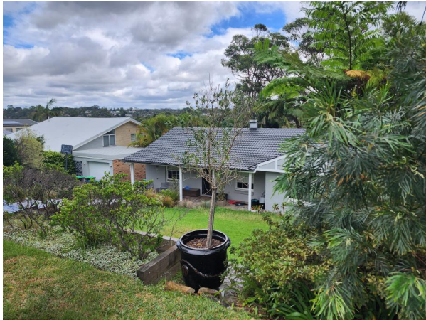
Subject site, looking West