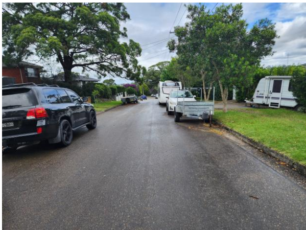
Warekila Road, looking South