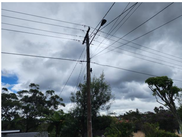
Above ground electrical supply