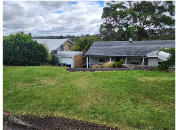
Existing access/driveway, looking West