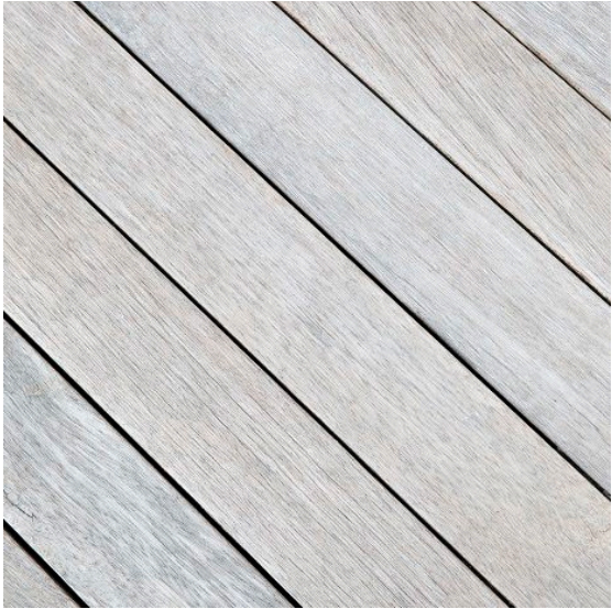
3. External Timber Decking