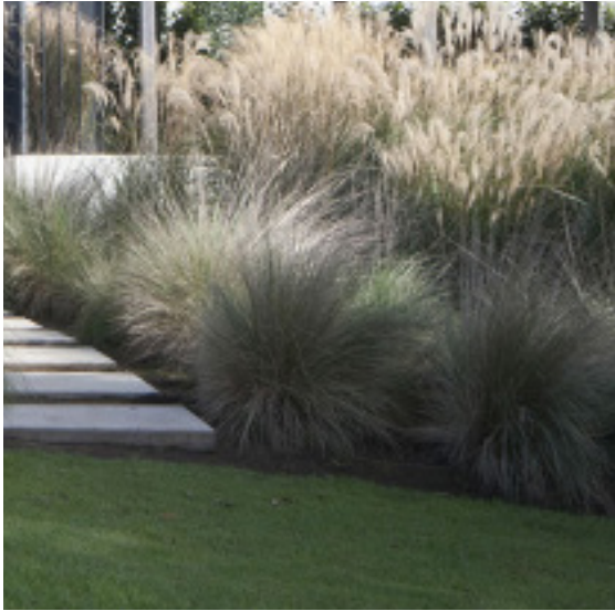
4. Native Gardens