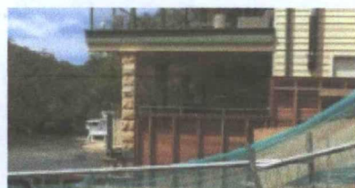
Lower section of fence we wished to have approved. This is the northern side (Lot 3's view) It is be painted in merbau tinted fire retardant paint but will retain its current pleasant appearance