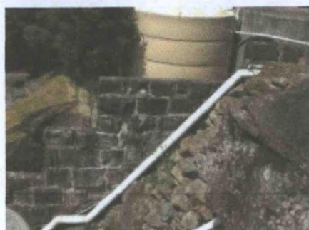
Boundary fence between 4 & 5 Notting Lane; stone construction