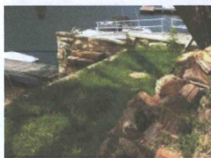
Lowest section of fence we wished approved; stone construction