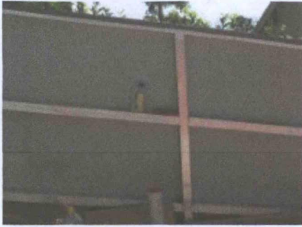
Boundary fence between 3 and Lot 3 as seen from Lot 3