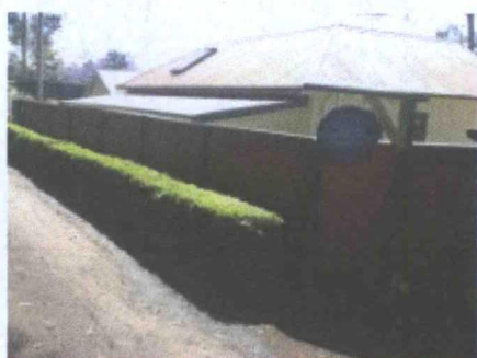
Metal fence fronting 4 Notting Lane; metal and timber construction