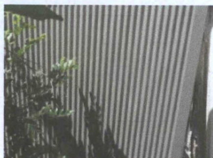
Boundary fence between 3 and Lot 3 as seen from #3. The proposed fence will match this colour for increased visual appeal.