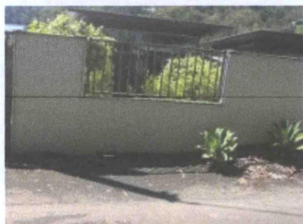
Front fence of 5 Notting Lane; metal and timber construction