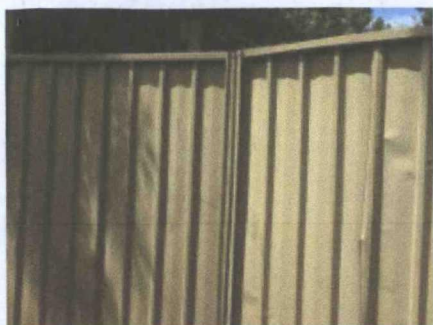
Boundary fence between Ku-ring Gai Motor Yacht Club and Cottage at corner of Notting Lane and Cottage Point Road; metal construction