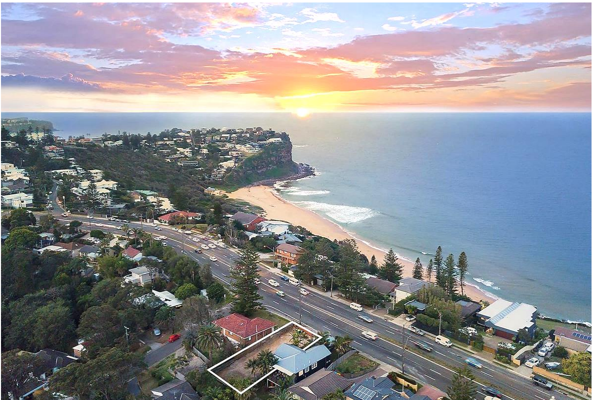
Figure 5: Oblique aerial photo facing east showing the subject site outlined in white and the surrounding context