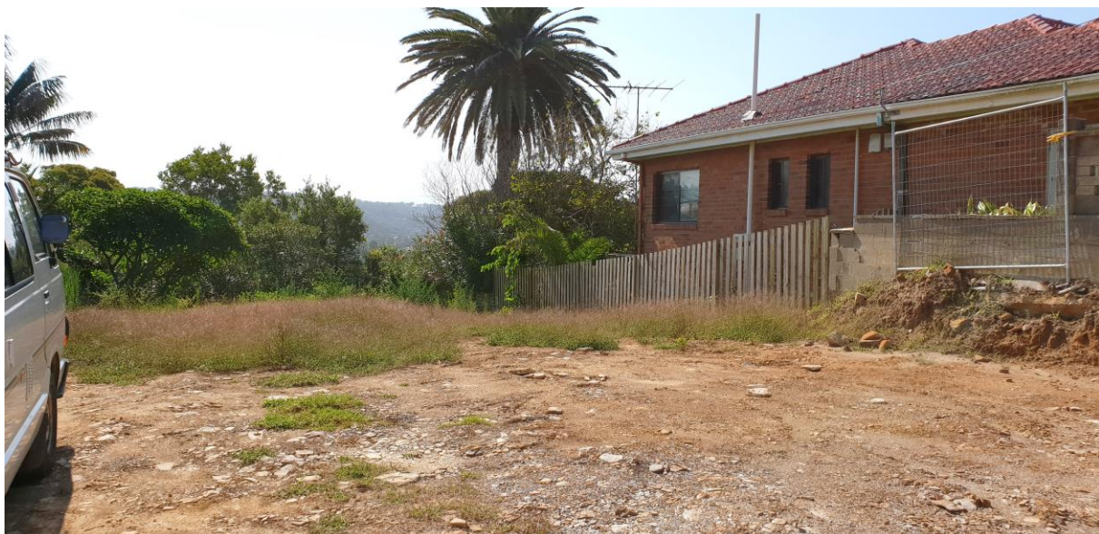
Figure 3: Photograph showing the subject site to be vacant land (looking west)