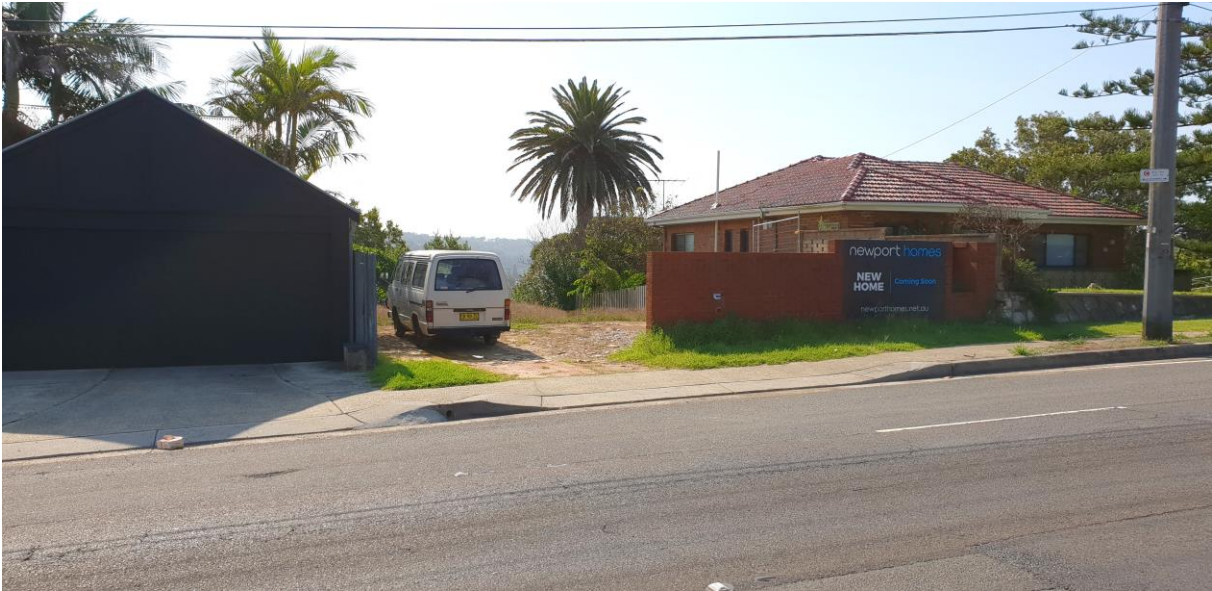
Figure 4: The subject site as viewed from Barrenjoey Road