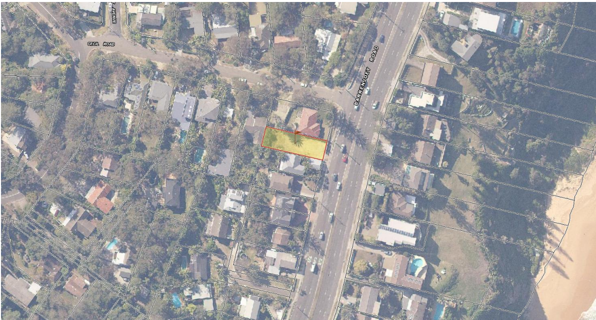
Figure 7: Aerial photo showing the location of the subject site in relation to surrounding wider context

Barrenjoey Road is a classified road that follows the coastline through many of the Northern Beaches suburbs. The development surrounding the subject site is predominately single or two storey dwelling houses. The character of the area was established predominantly in the 1945-1965 period and exhibits an informal coastal residential setting. Refer to Figure 7.