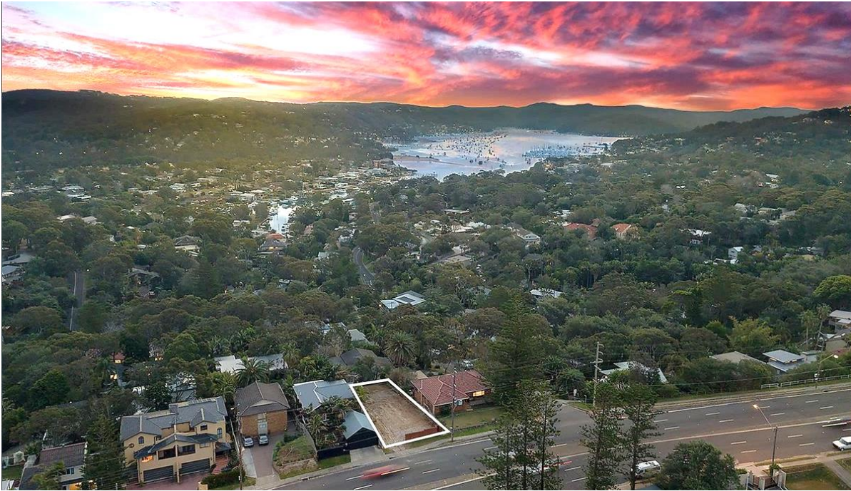
Figure 6: Oblique aerial photo facing north-west showing the subject site outlined in white and the surrounding context