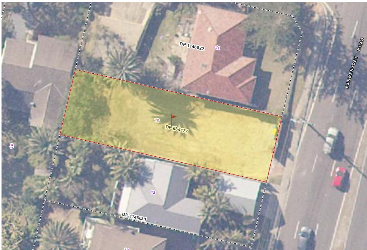
Figure 2: Aerial photo of the subject site

The land has a total area of 474.2m 2 . The front and rear boundaries have a width of 12.19m while both the northern and southern side boundaries are 38.71m in length. The site is currently vacant land with no structures or significant trees. There are single dwellings on the adjoining allotments to the north, south and west of the subject site.