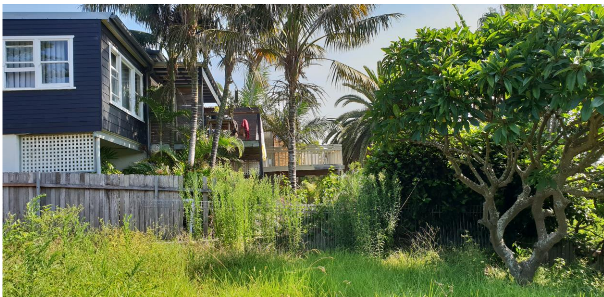
Figure 9: Rear verandahs in the rear yards of the adjoining dwellings at Nos. 181 and 179 Barrenjoey Road Newport. Elevated rear verandahs are common where views to the west are available.

Accordingly, the proposal is considered to maintain privacy for the subject site and neighbouring properties. Should Council still have concerns over privacy, conditions may be applied or fenestration may be altered prior to the granting of consent.