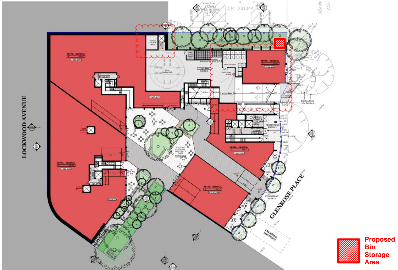
Source: DKO Architecture, 28 Lockwood Ave Belrose, Drawing No DA202, Rev B, Jan2020 – Basement 2